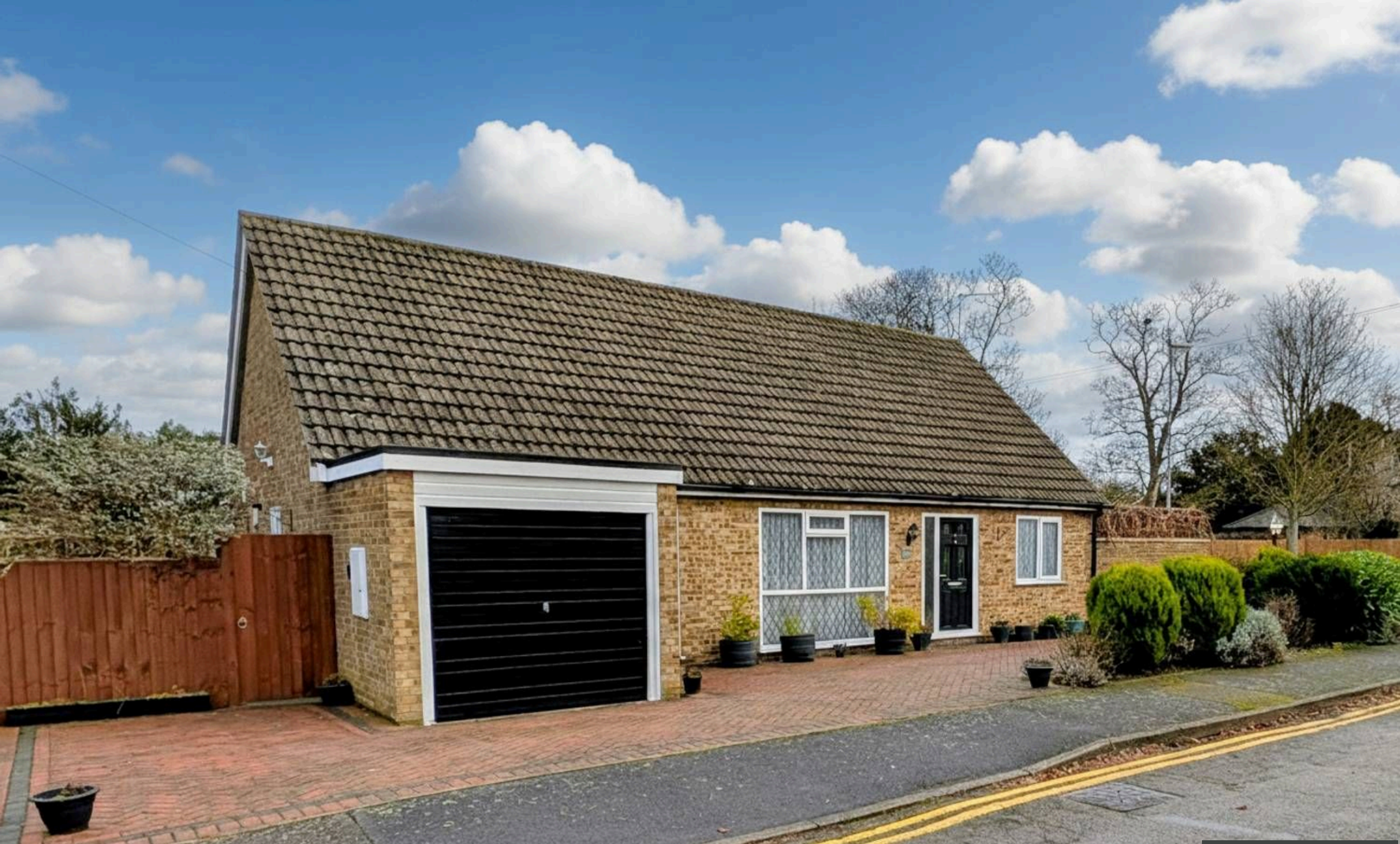
Hall Close, Hartford - PE29 1XJ £435,000