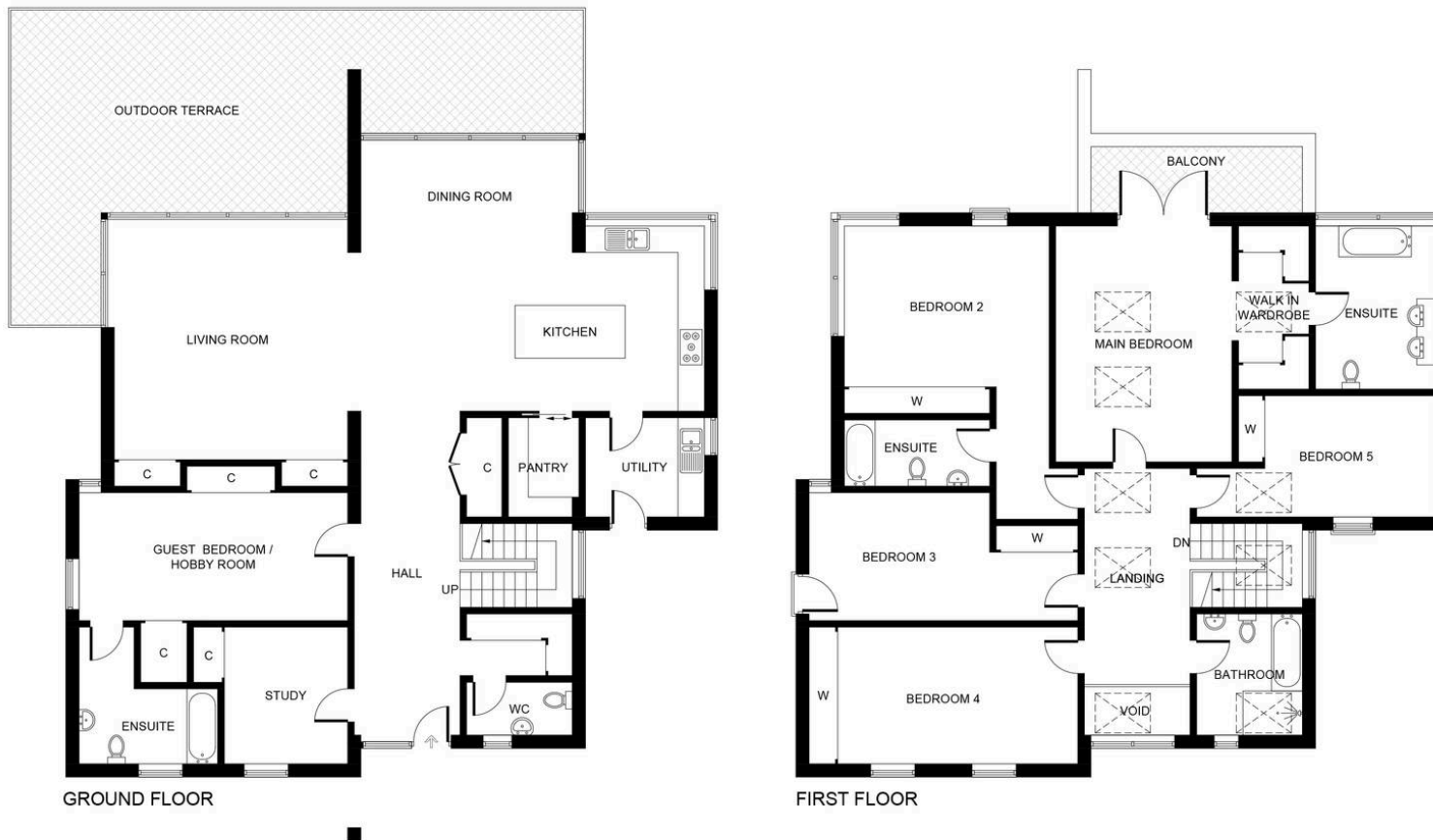
Illustration for identification purposes only, measurements are approximate, not to scale. (ID1185465)

Approximate Gross Internal Area = 3326 sq ft / 309.0 sq m