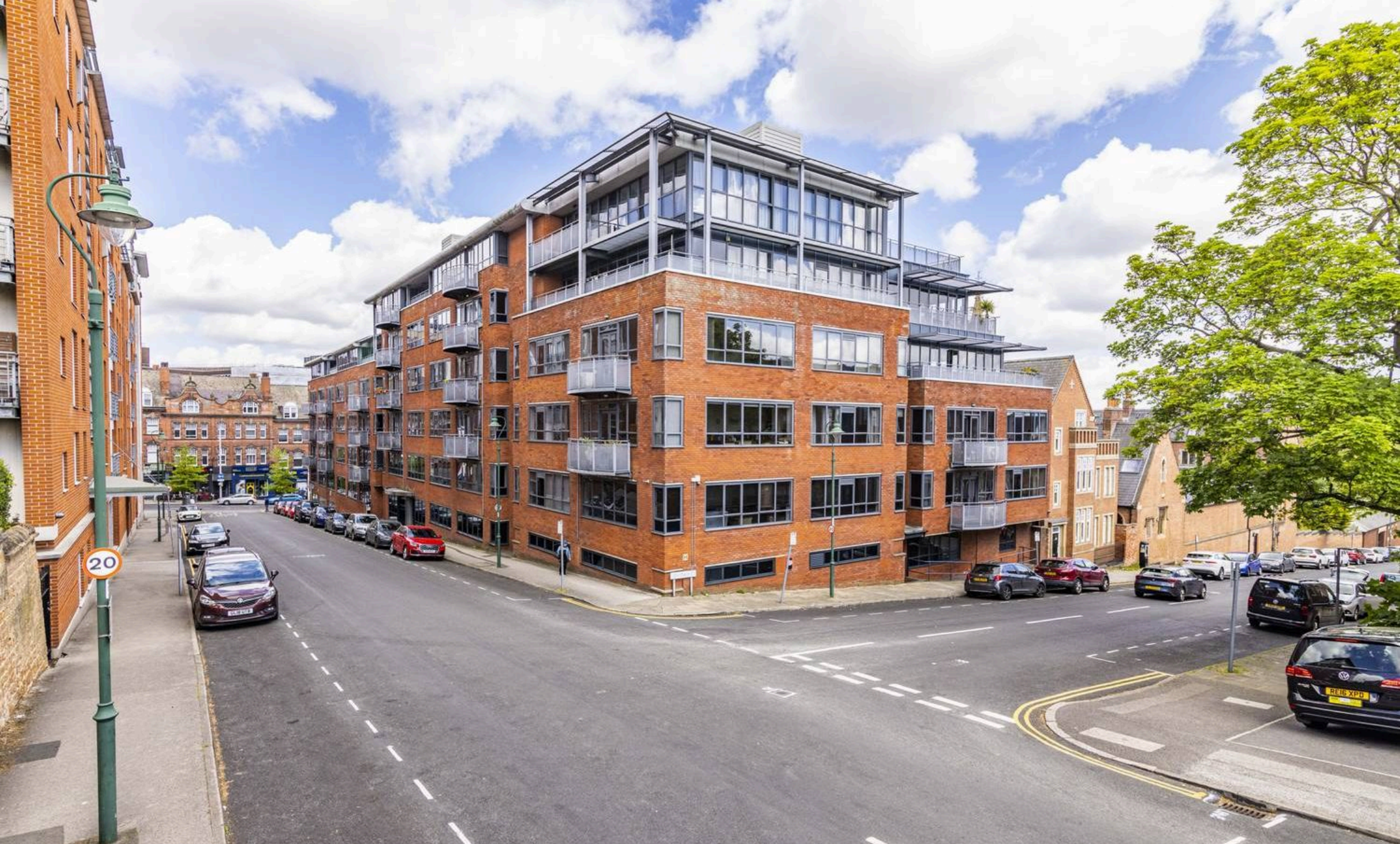
Parkgate, Upper College Street, Nottingham £1,250 pcm