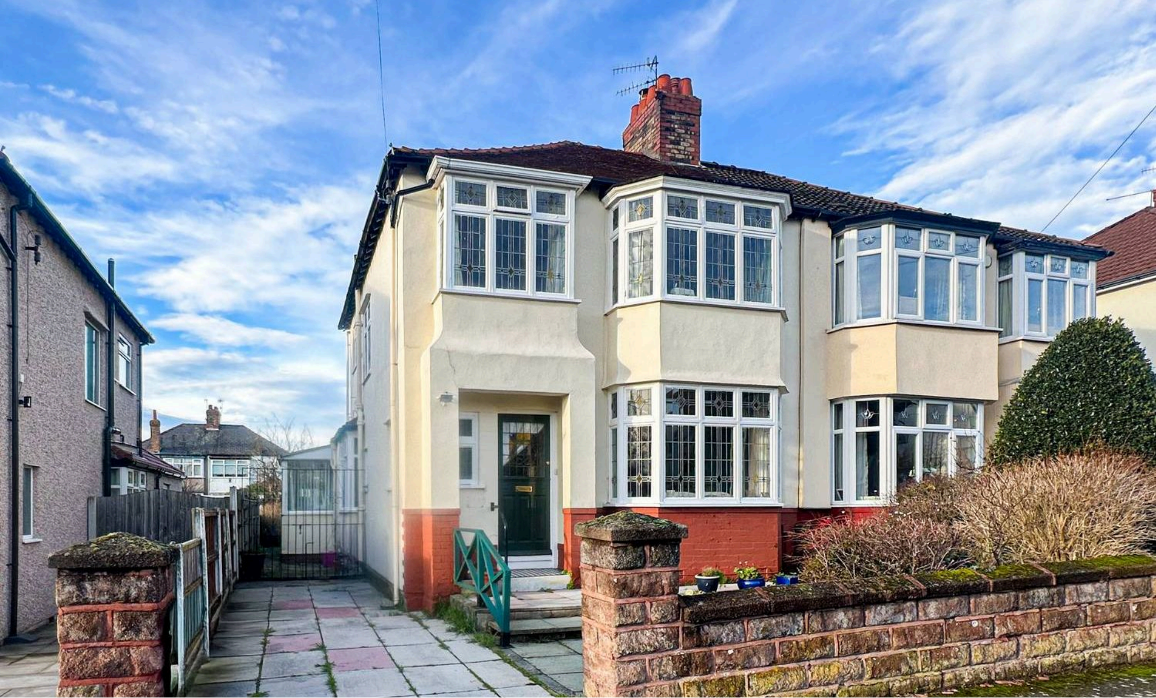
5 Chequers Gardens, Liverpool Liverpool