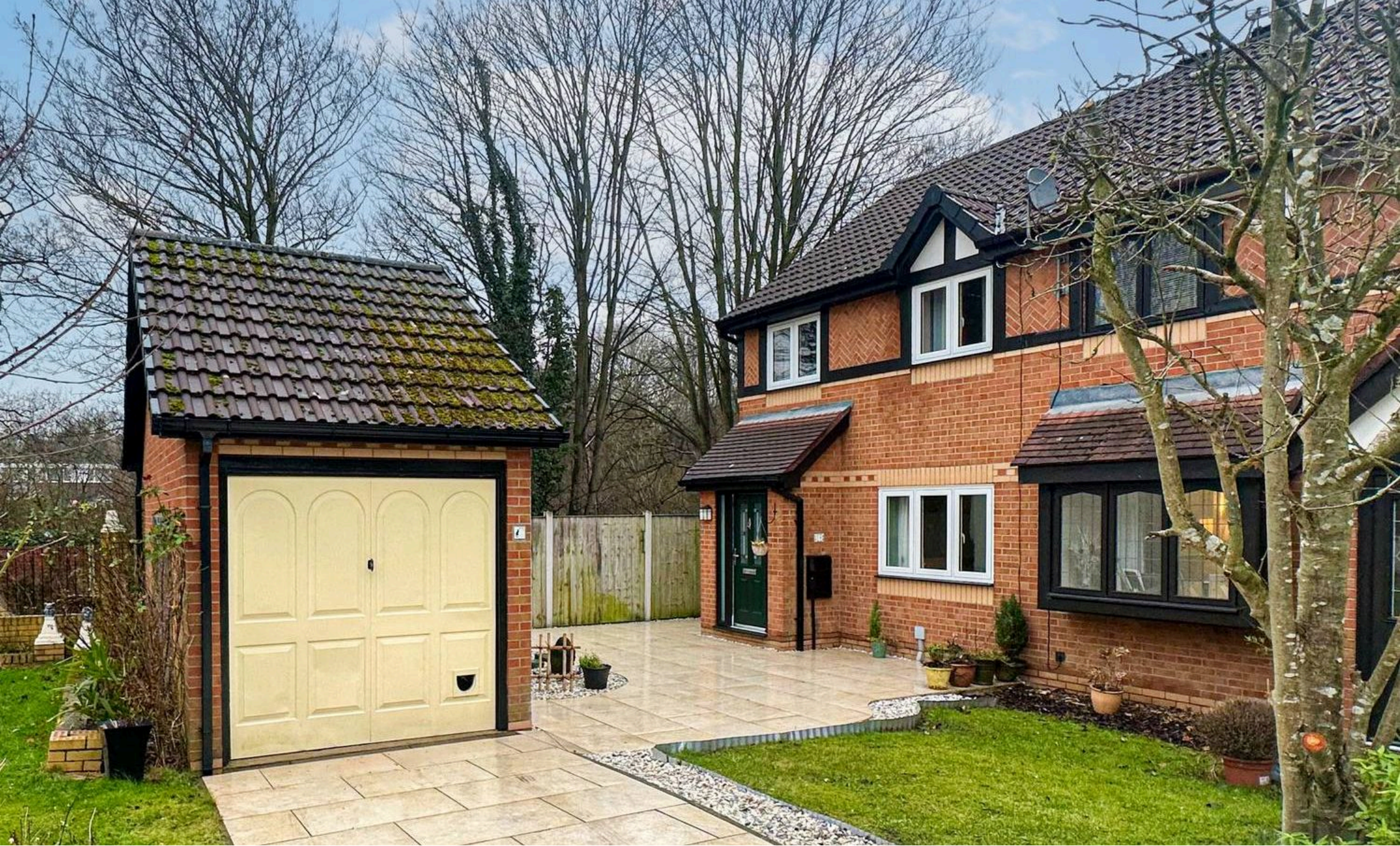
Roxborough Walk, Woolton Liverpool