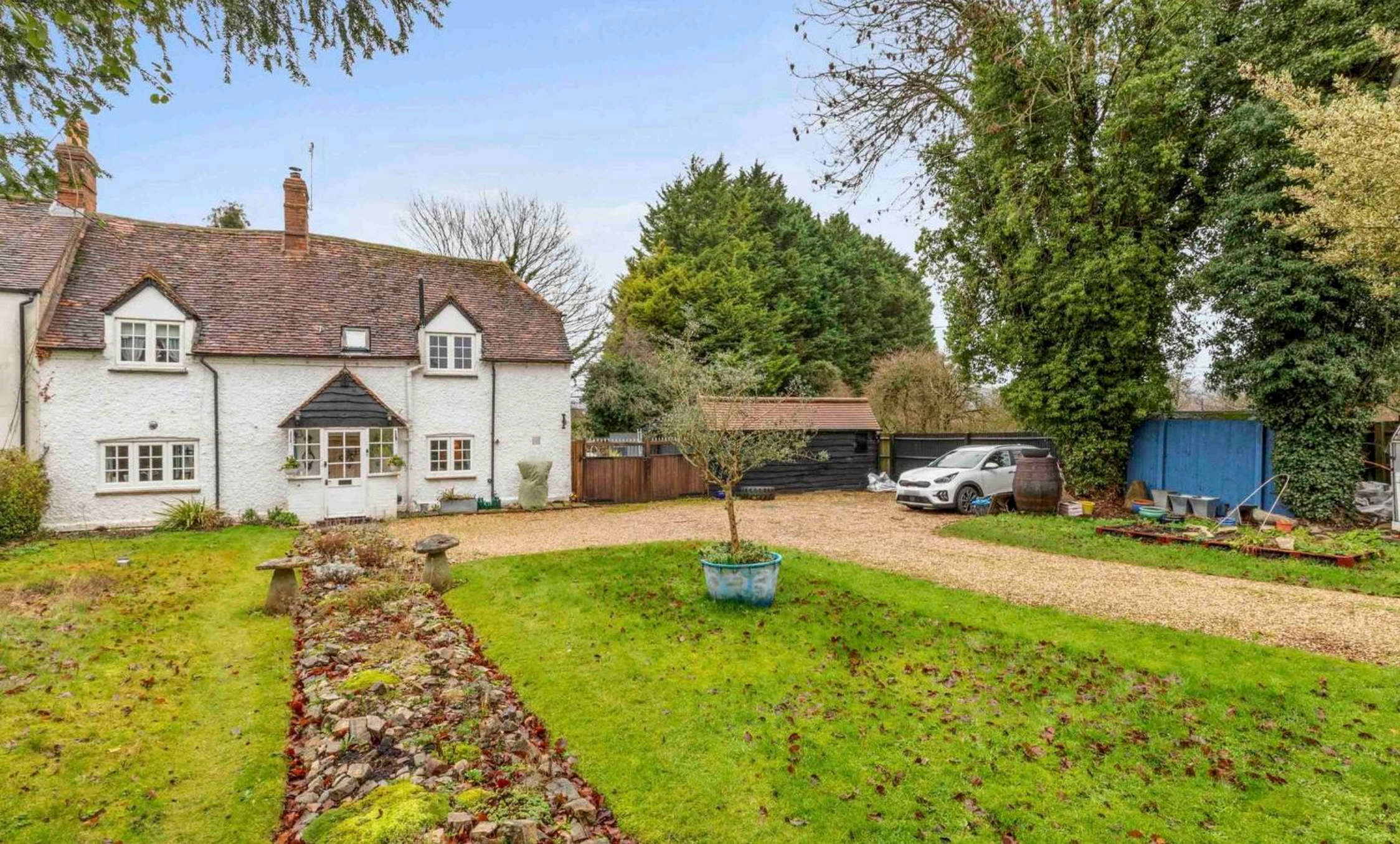
Littlegate Aylesbury Road, Askett £750,000