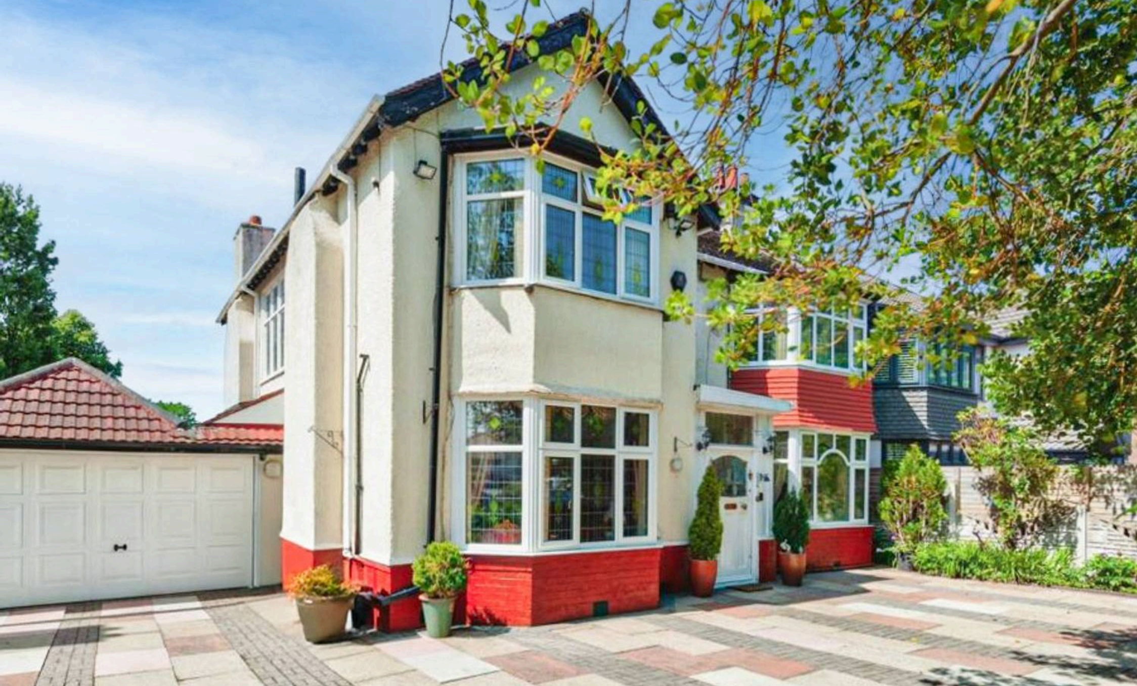
Queens Drive, Wavertree Liverpool