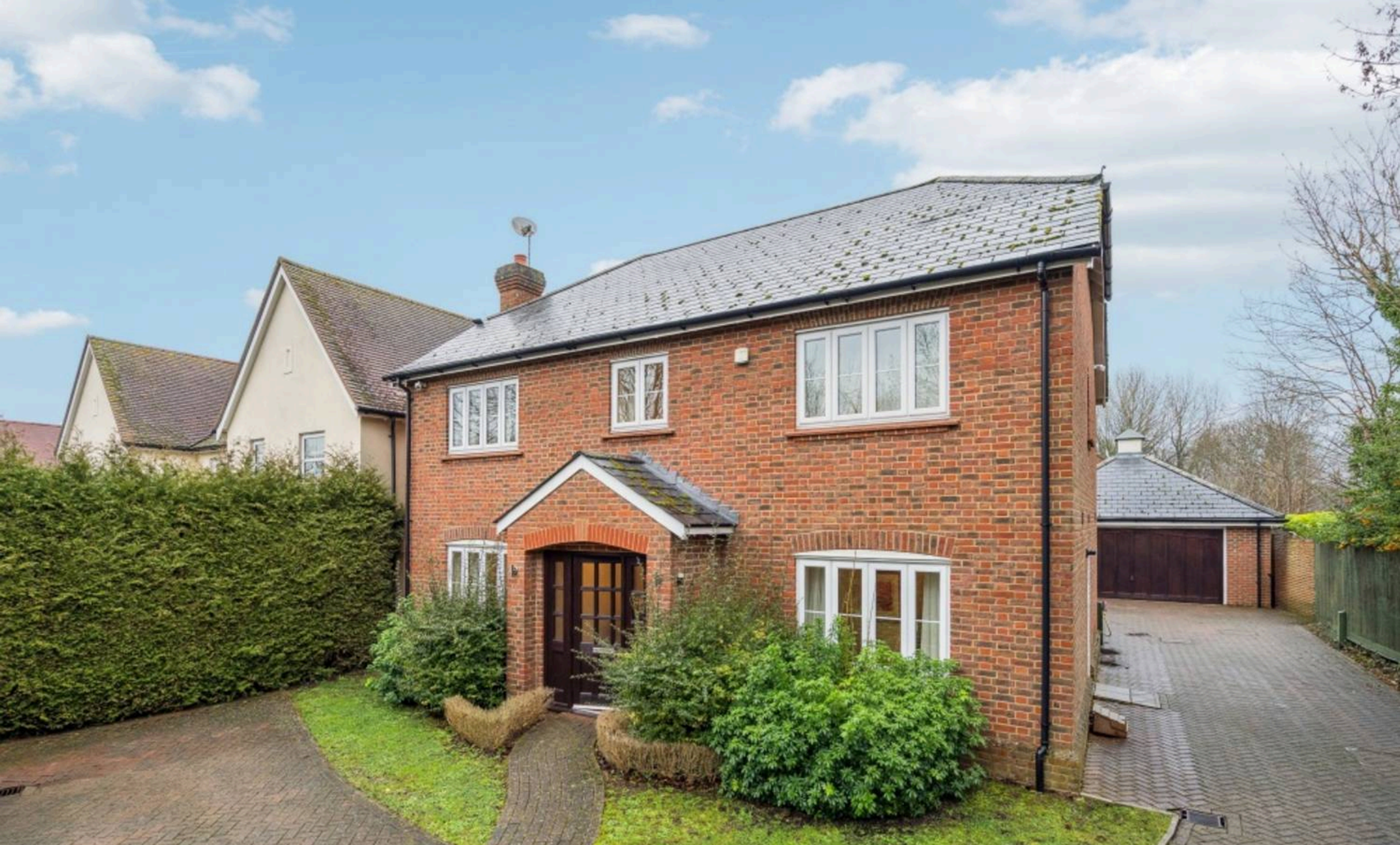
Mandarin Bay Mill Lane, Monks Risborough - HP27 £925,000