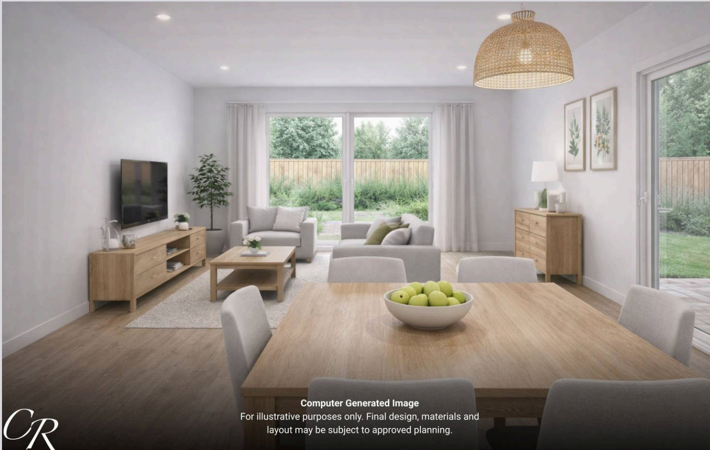
Computer Generated Image For illustrative purposes only. Final design, materials and layout may be subject to approved planning.