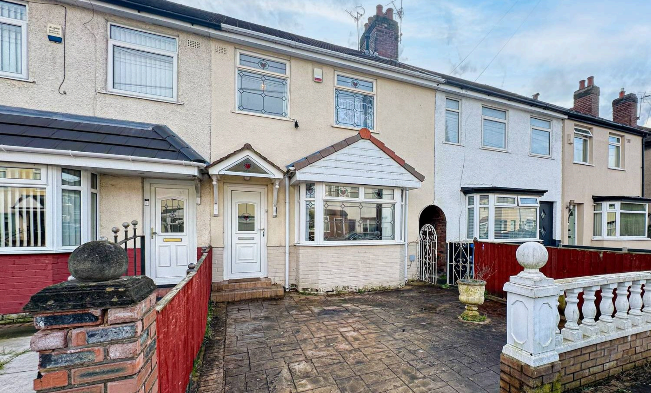
Whitelodge Avenue, Huyton Liverpool