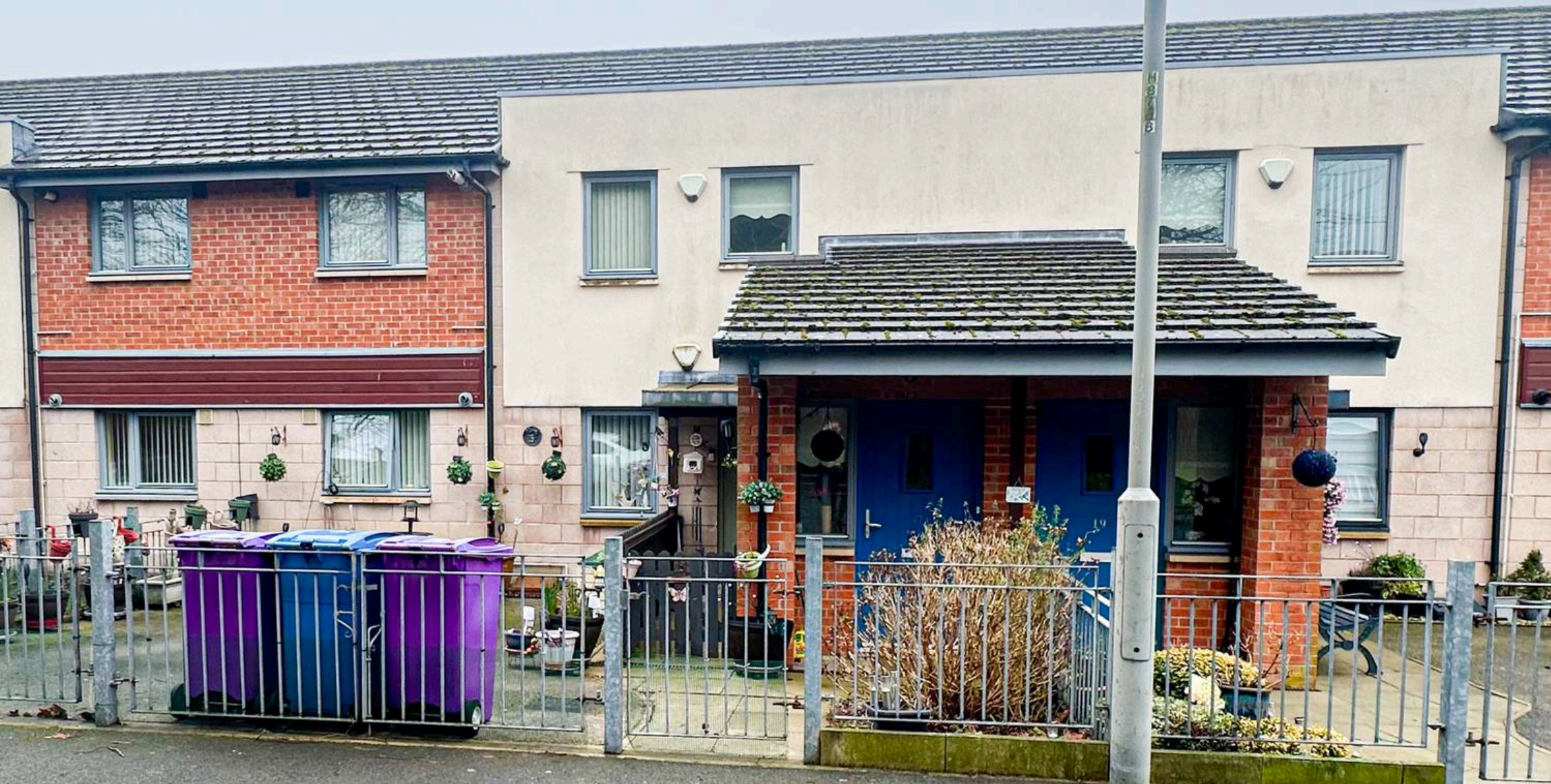
Coulsdon Place, L8 Liverpool