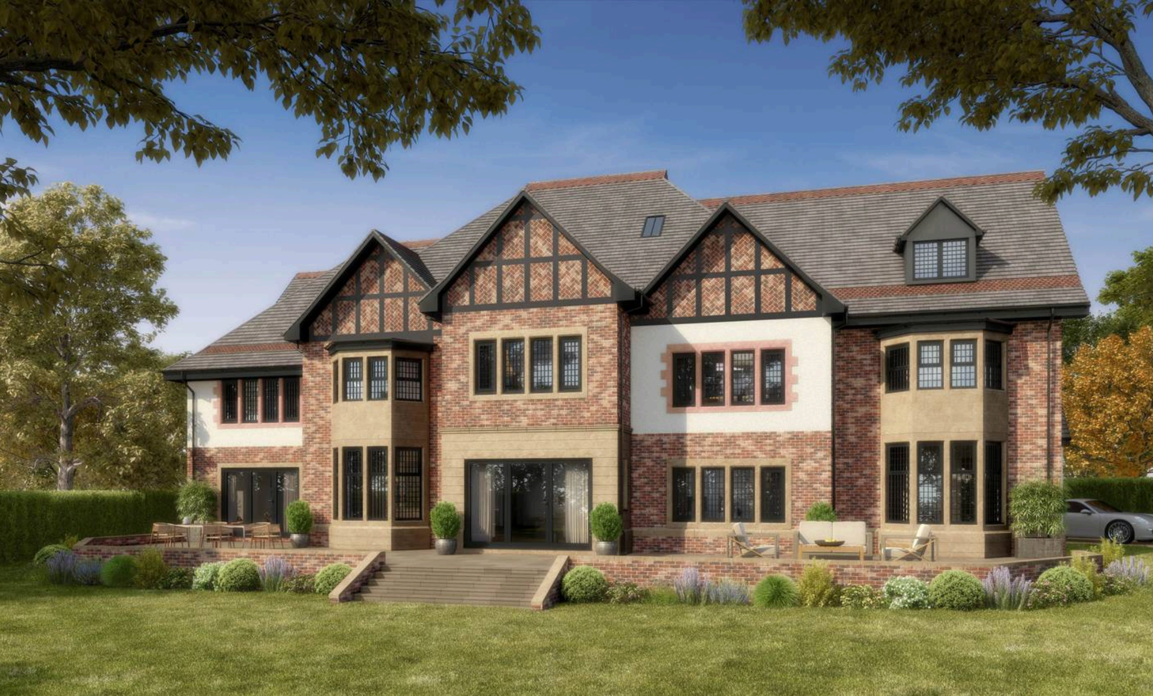
Brockdale House Shore Lane, Caldy Wirral