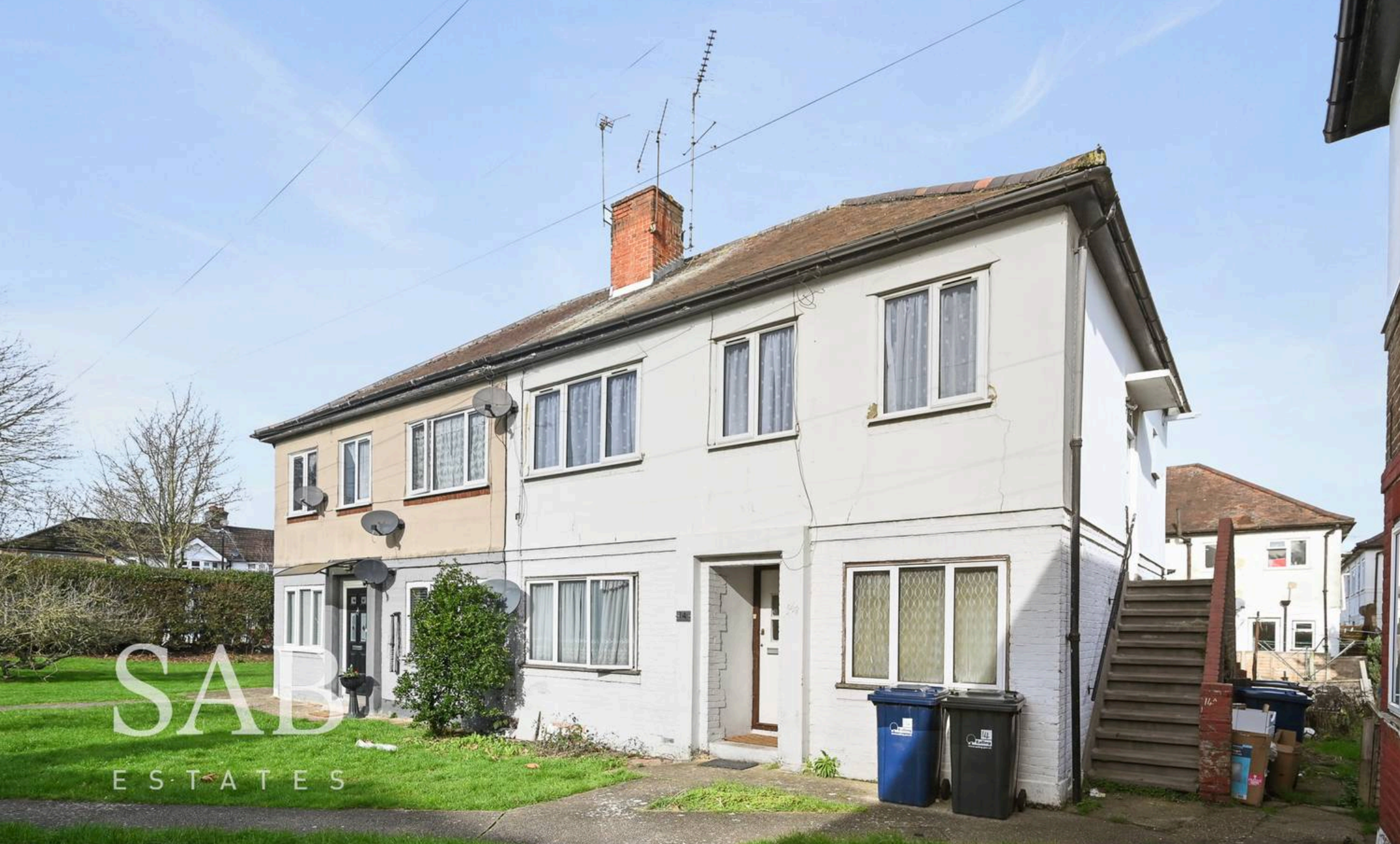
Greenway Gardens, Greenford £325,000