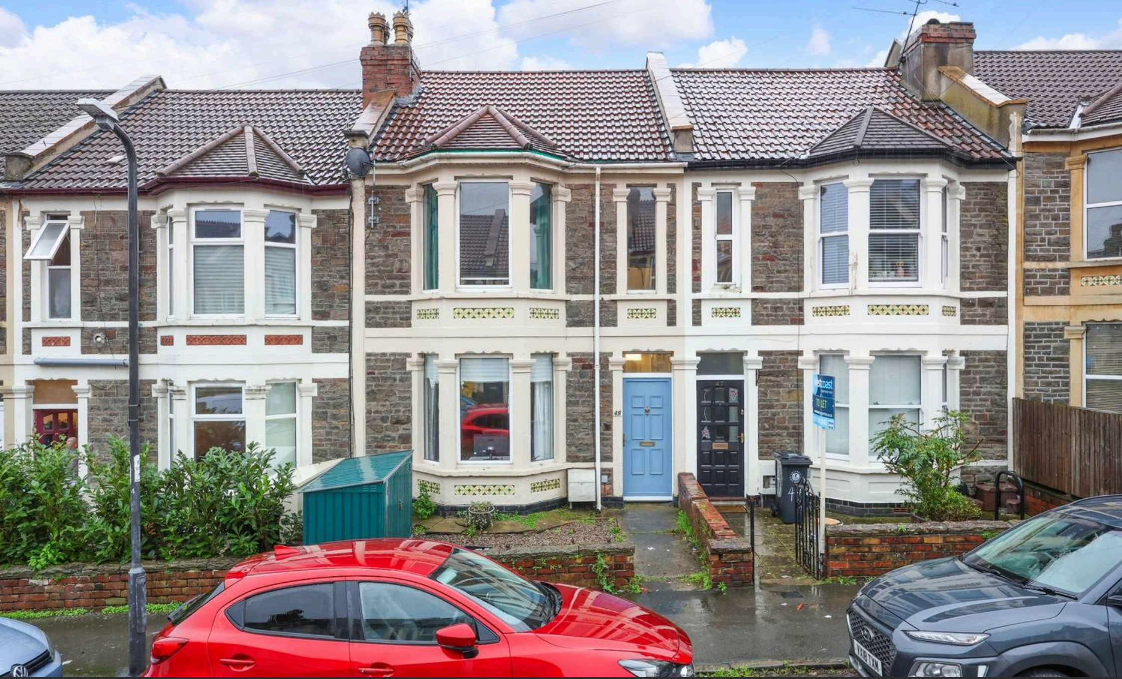
49 Quarrington Road, Bristol £595,000