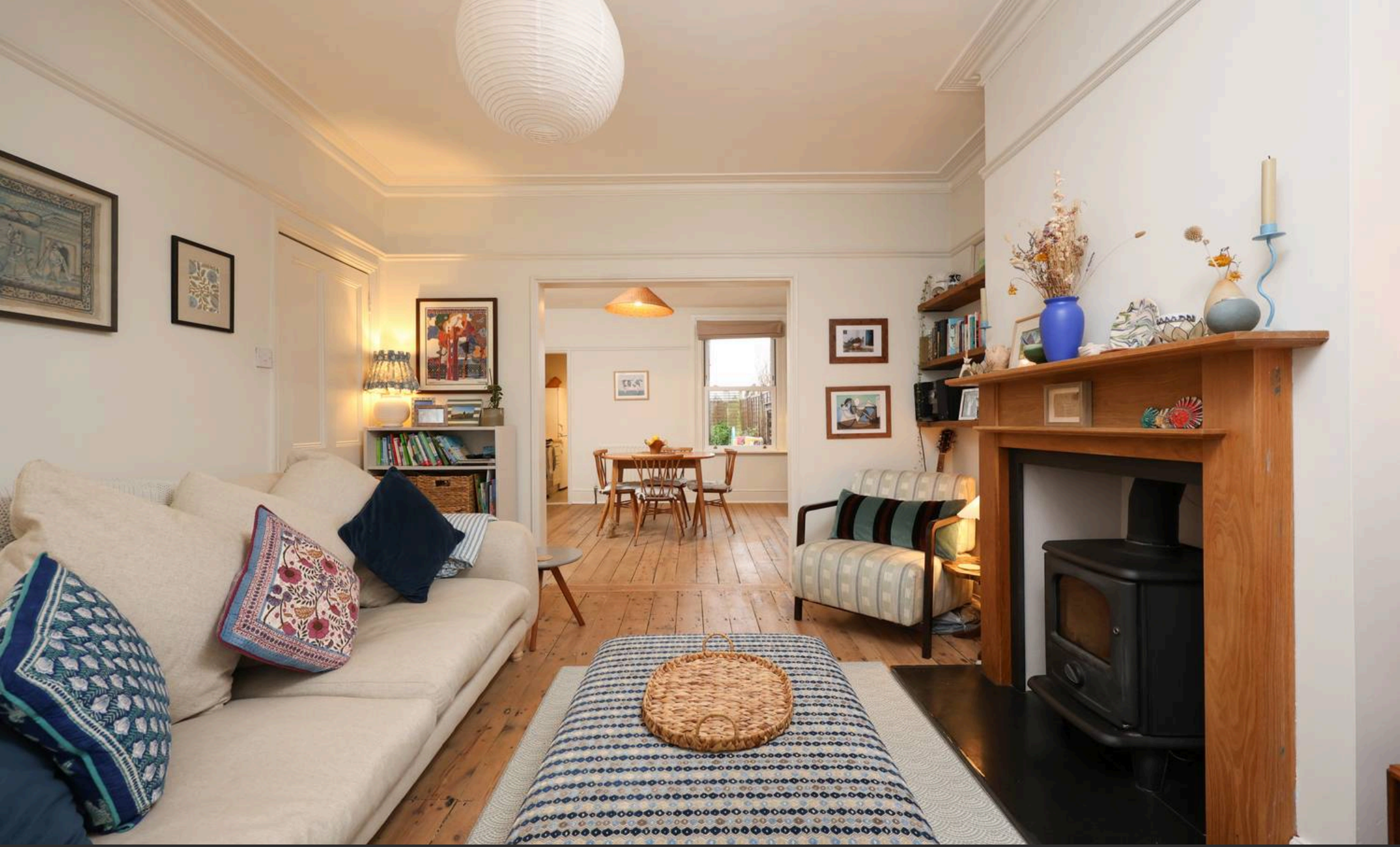
26 Melbourne Road, Bristol £525,000