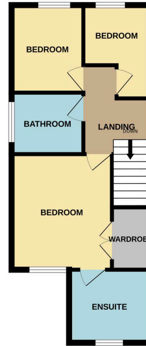
1ST FLOOR 412 sq.ft. (38.3 sq.m.) approx.