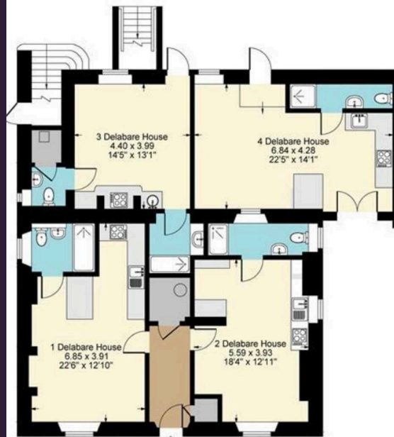
Ground Floor (Delabere House 1/2/3/4)