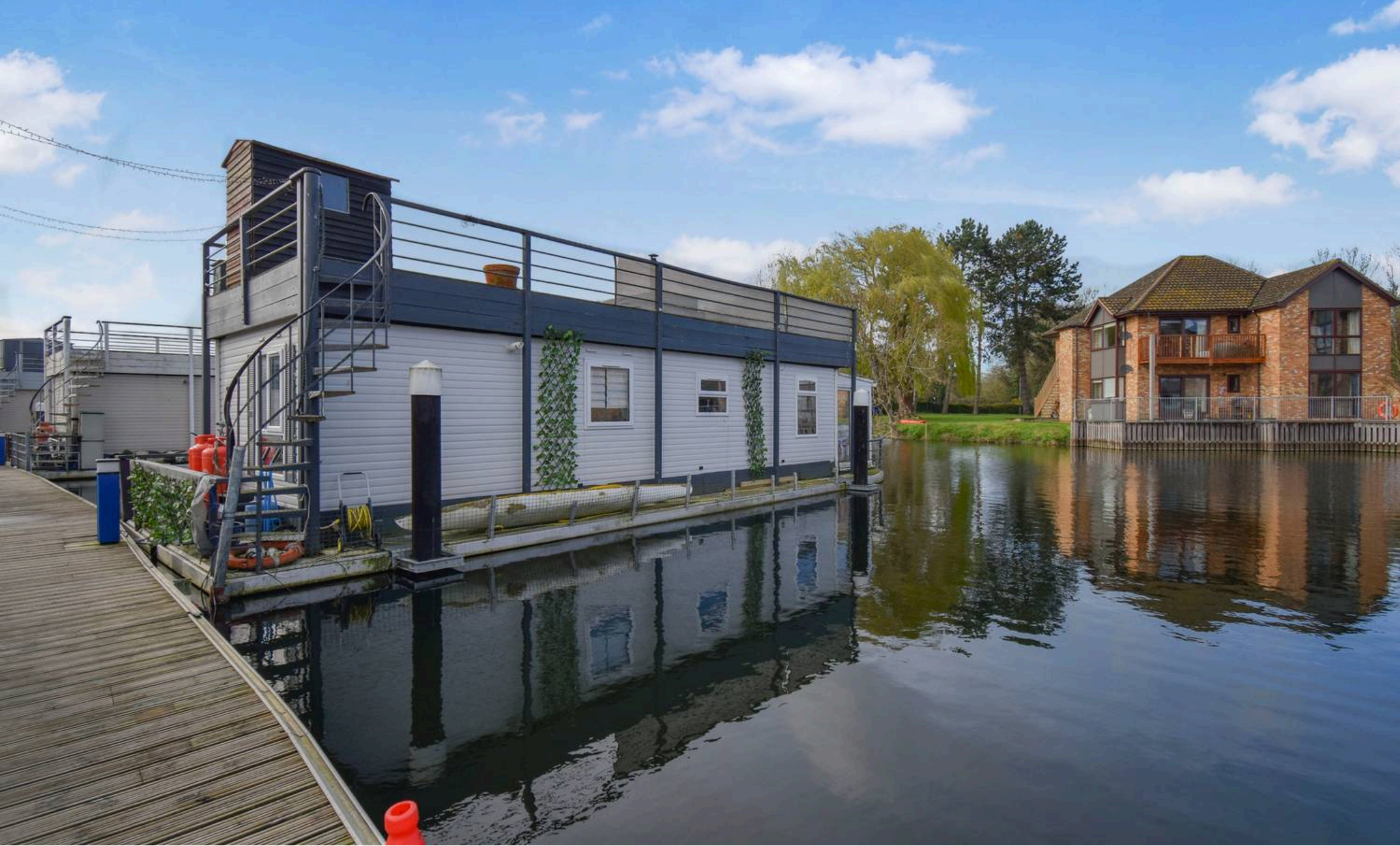
Houseboat 13, Hartford Marina Banks End £68,500