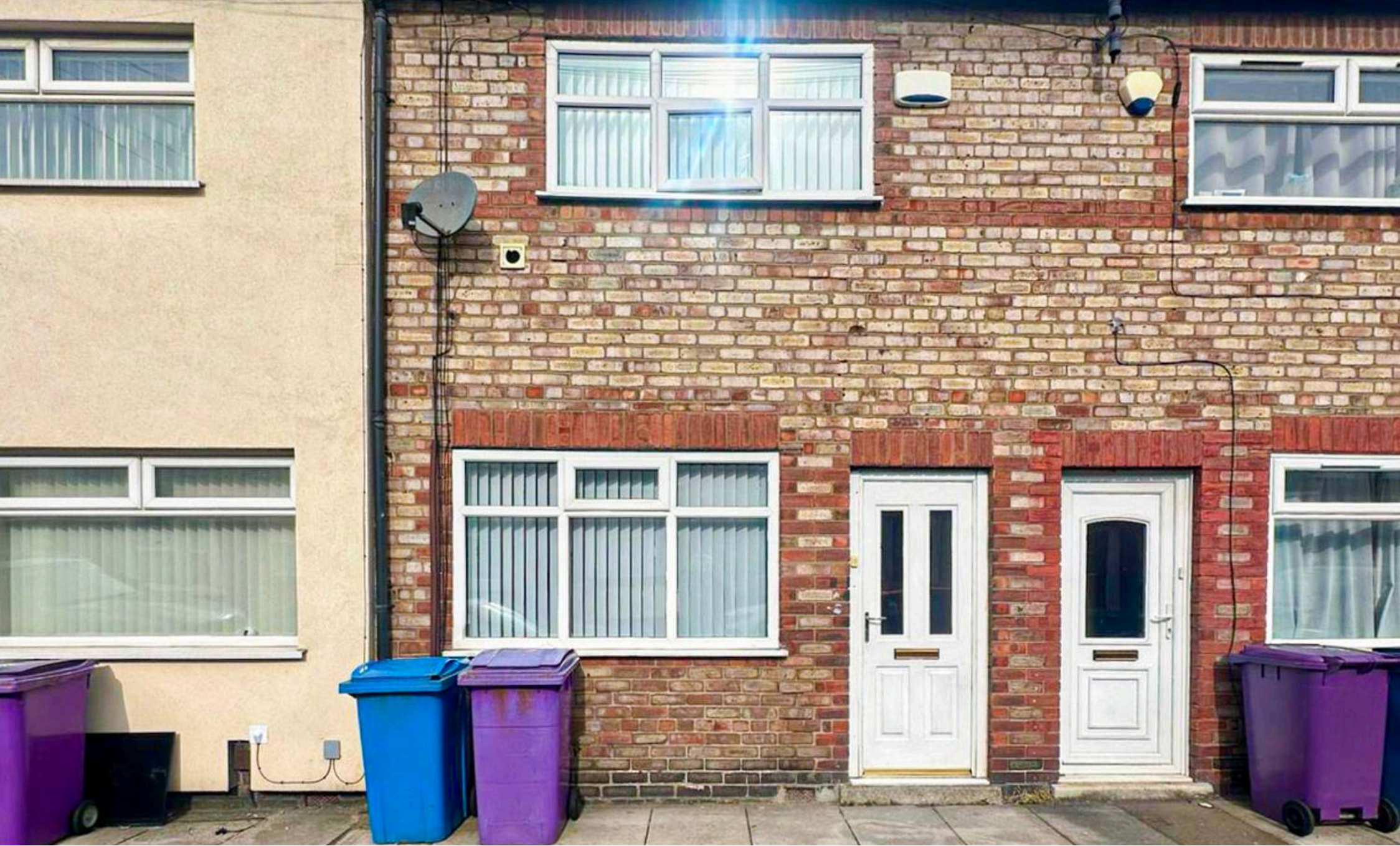
Bishopgate Street, Wavertree Liverpool