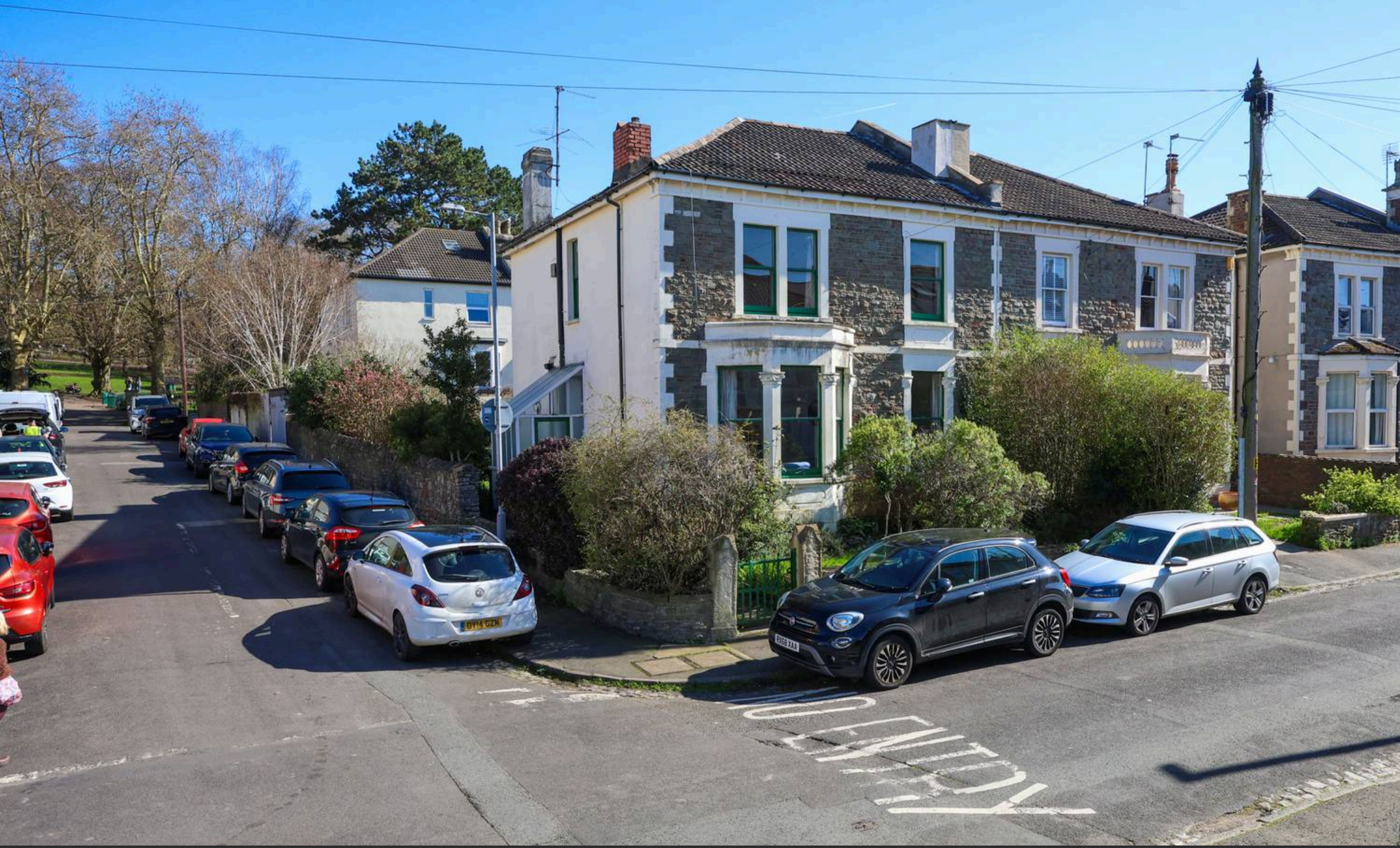
82 Belmont Road, St. Andrews £750,000