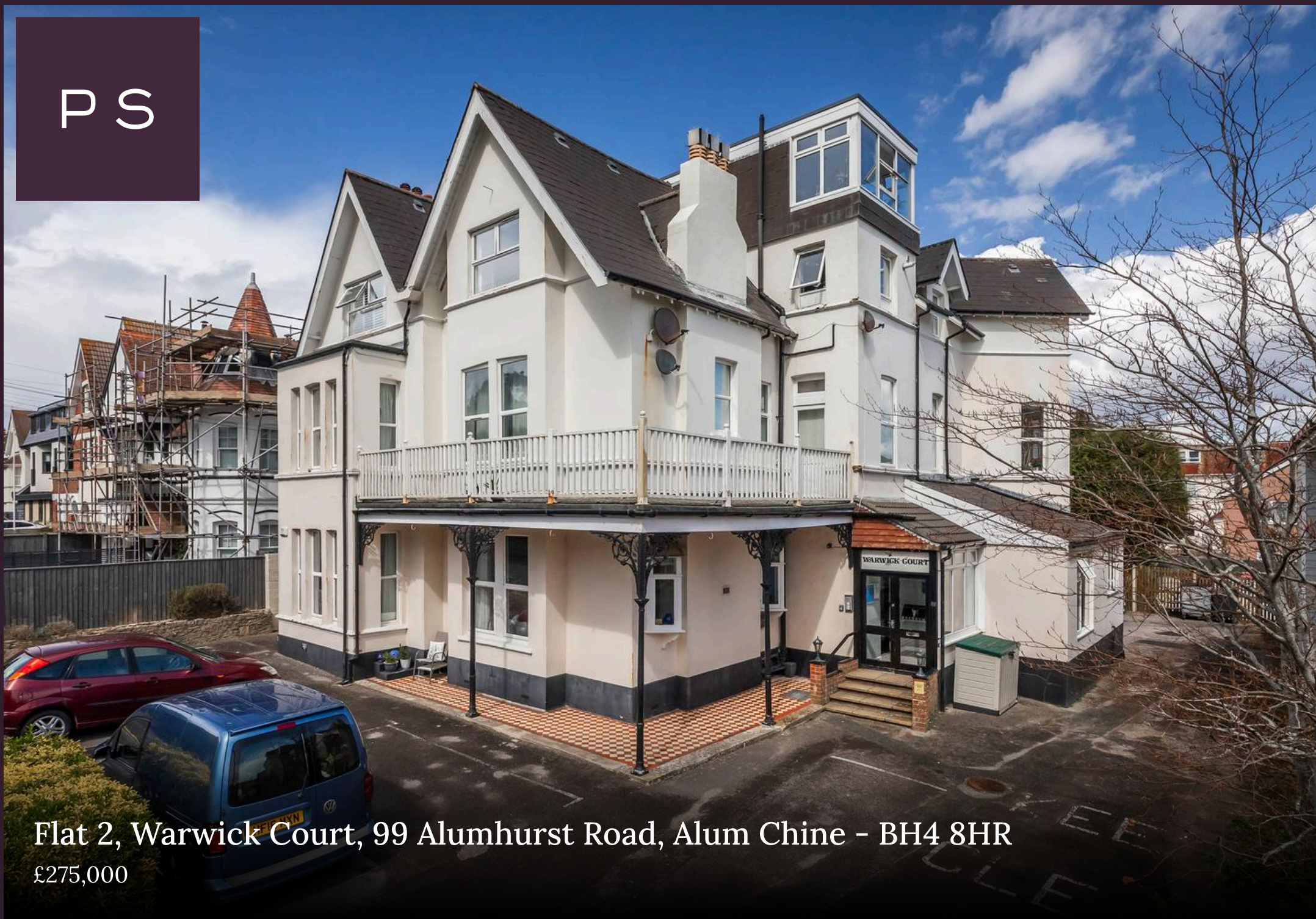
Flat 2, Warwick Court, 99 Alumhurst Road, Alum Chine - BH4 8HR £275,000