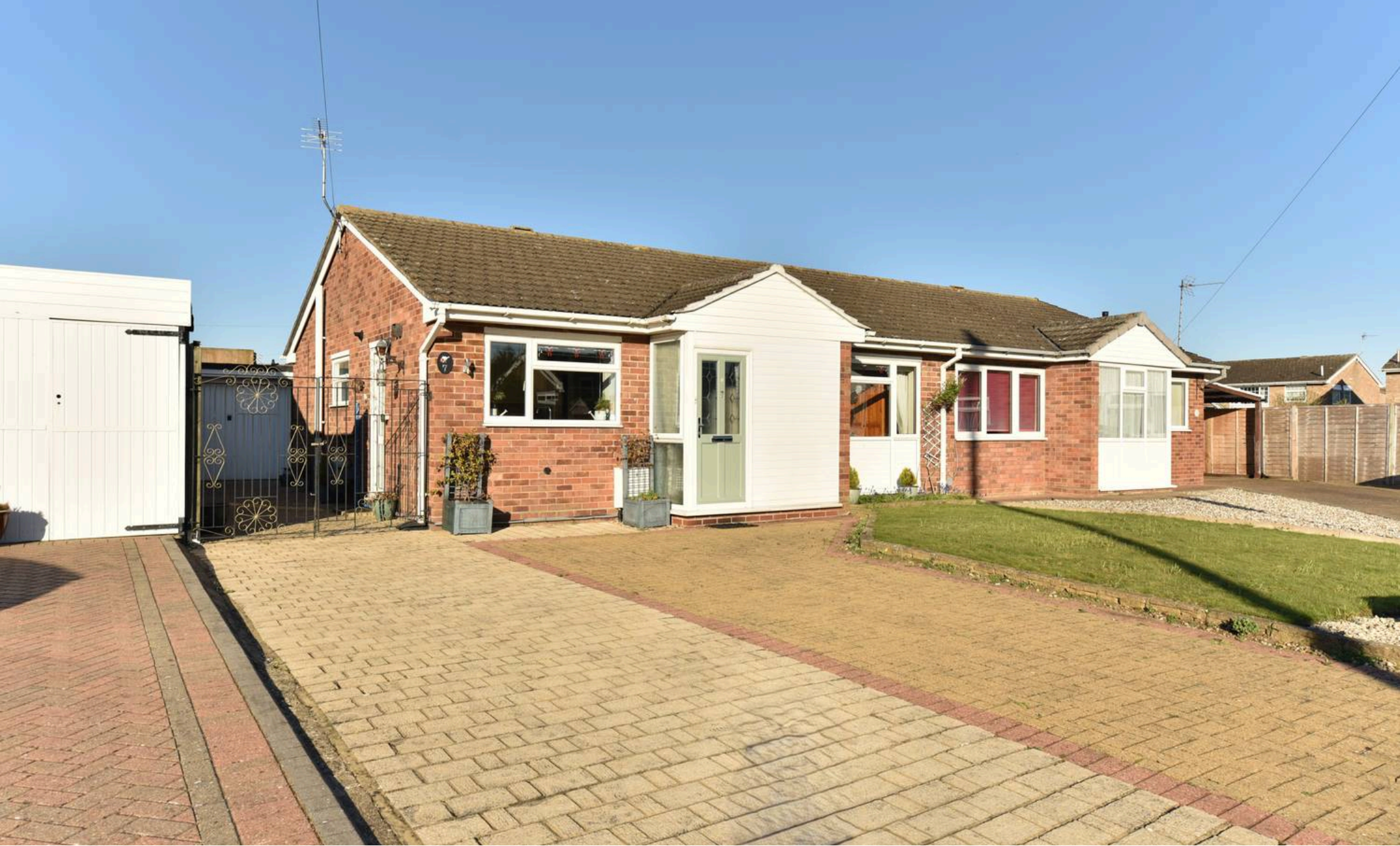
Leechcroft, Fenstanton £325,000