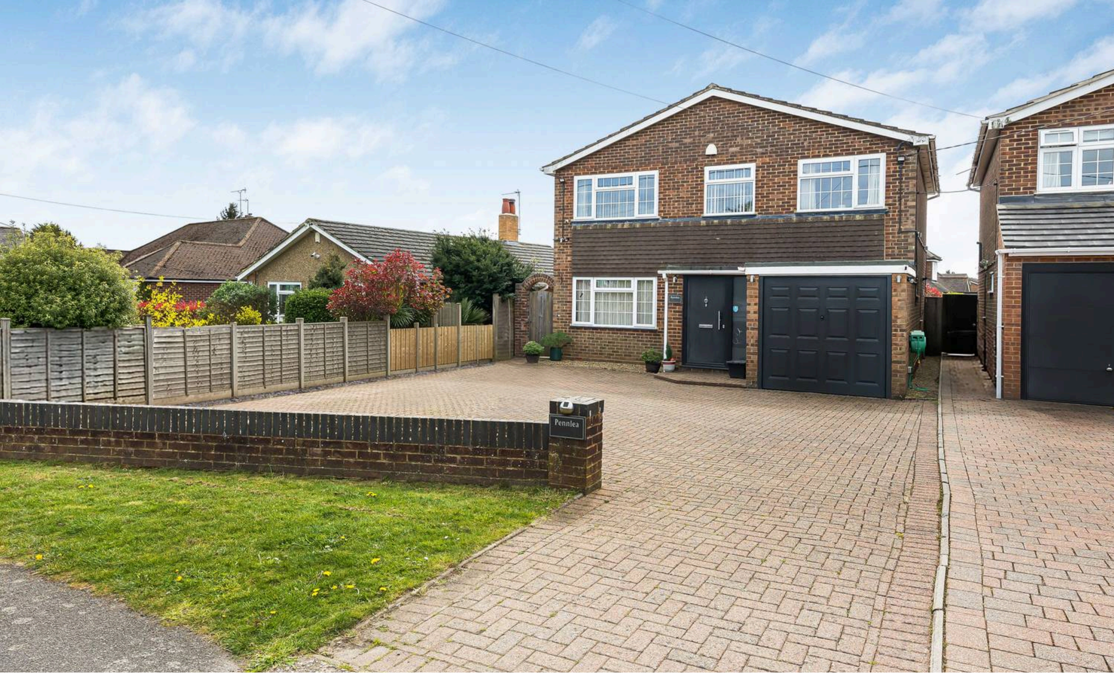
Pennlea, 89a Penn Road, Hazlemere, HP15 7NA £695,000