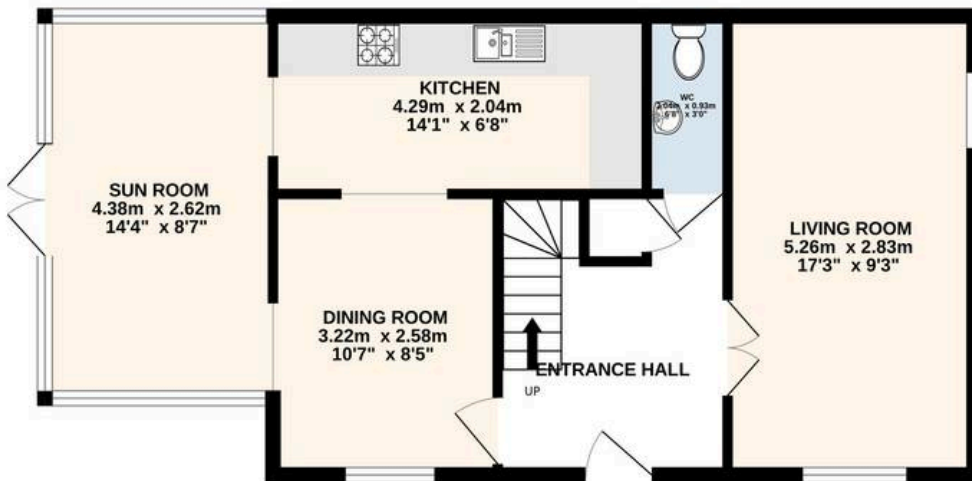
GROUND FLOOR 53.8 sq.m. (579 sq.ft.) approx.