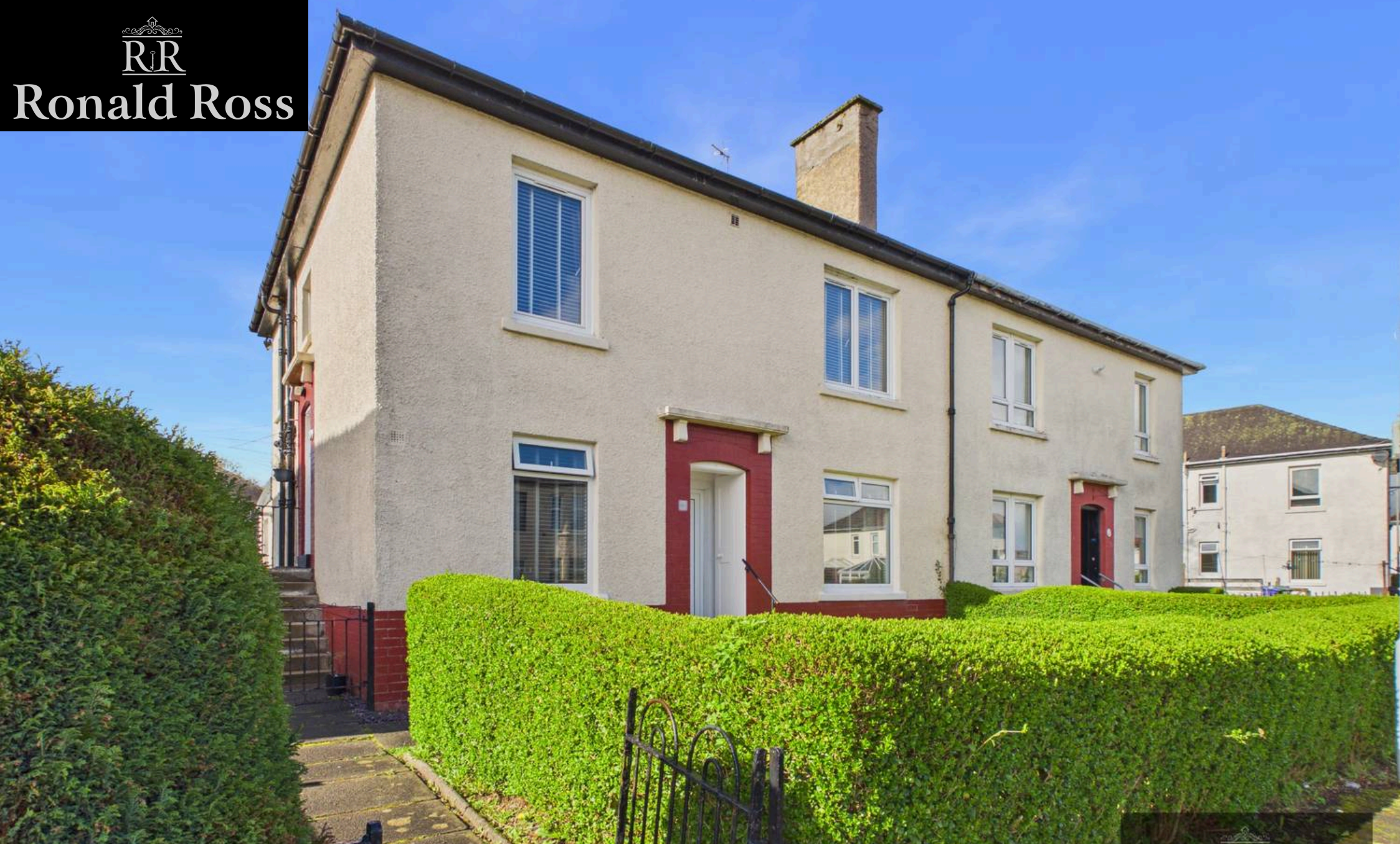
61 Dykebar Avenue, Glasgow