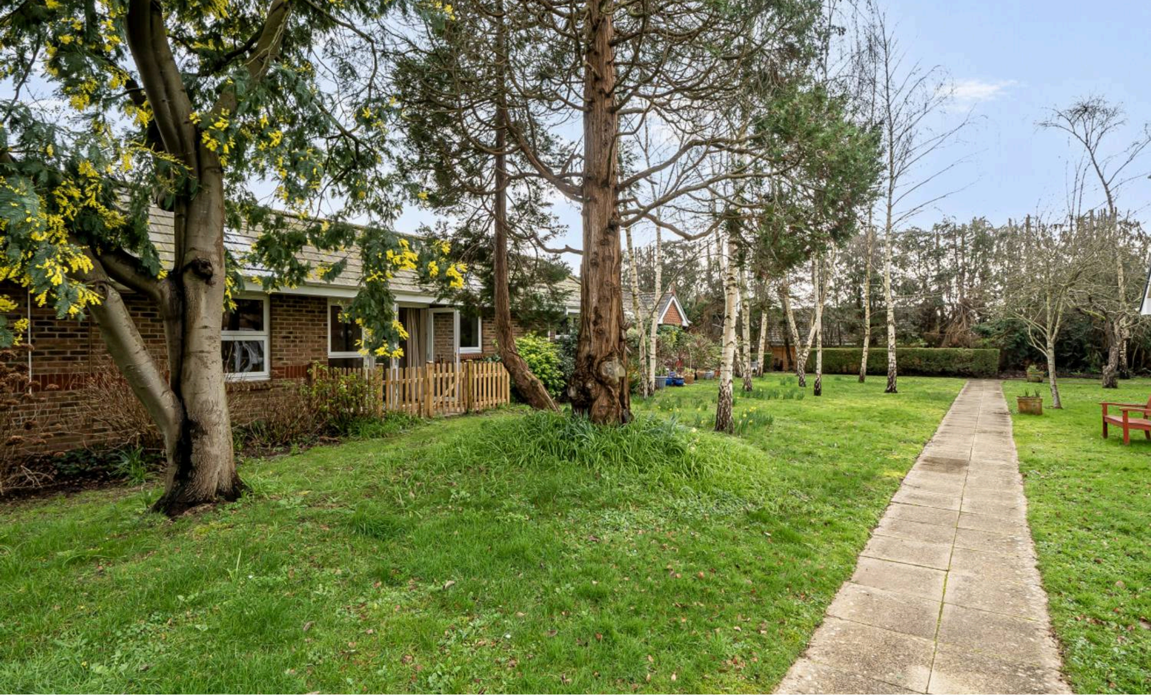
21 Claremont Gardens, Fontwell Avenue, Eastergate, PO20 3AD Guide Price £200,000 - Leasehold