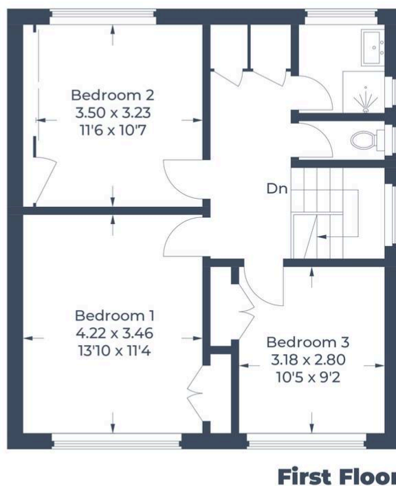
Illustration for identification purposes only, measurements are approximate, not to scale. © CJ Property Marketing Produced for Trend & Thomas