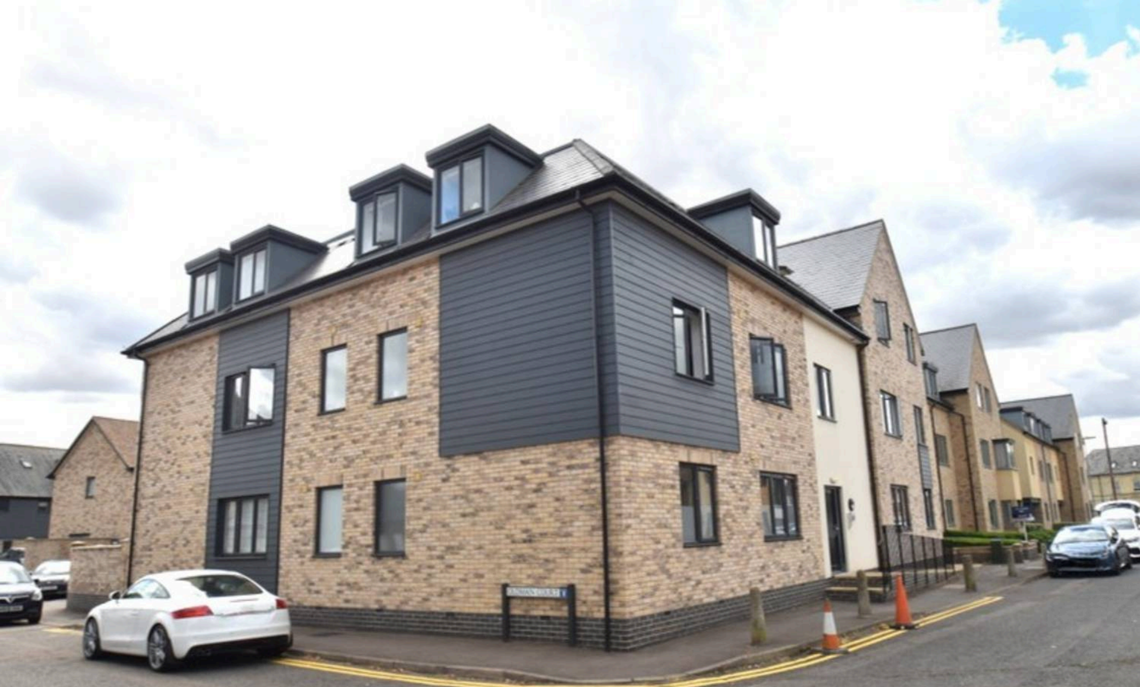
Osier House New Road, St. Ives £225,000