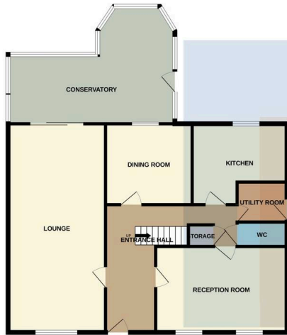
GROUND FLOOR 1105 sq.ft. (102.6 sq.m.) approx.