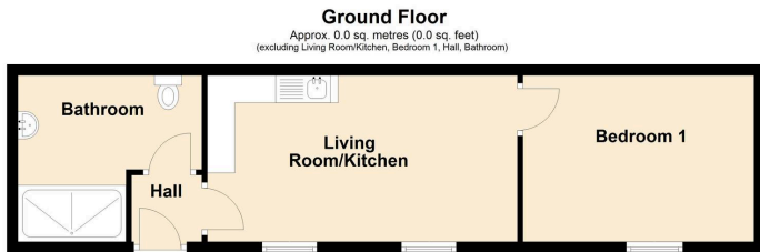
Total area: approx. 0.0 sq. metres (0.0 sq. feet) The Cottage, 69a Charles Street