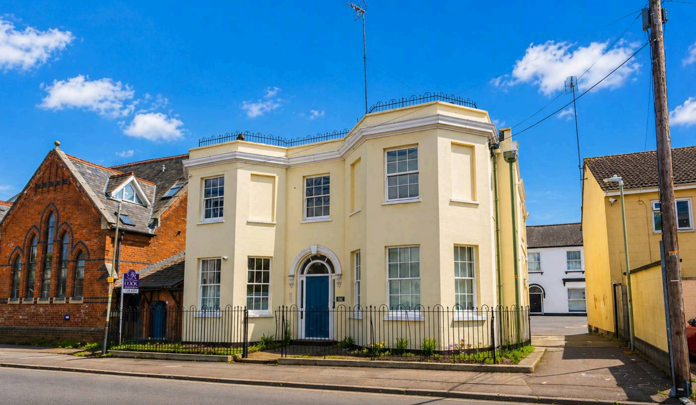
Flat 6, School House Oxford Passage Bennington Street