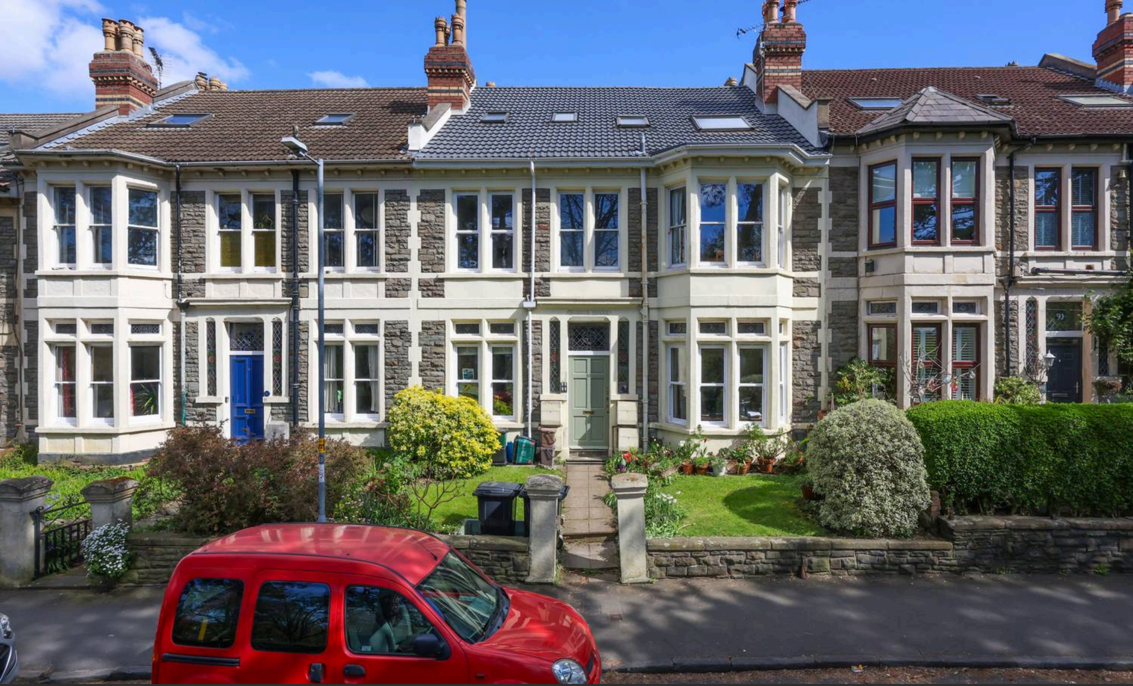
First Floor Flat, 89 Sommerville Road, Bristol £395,000