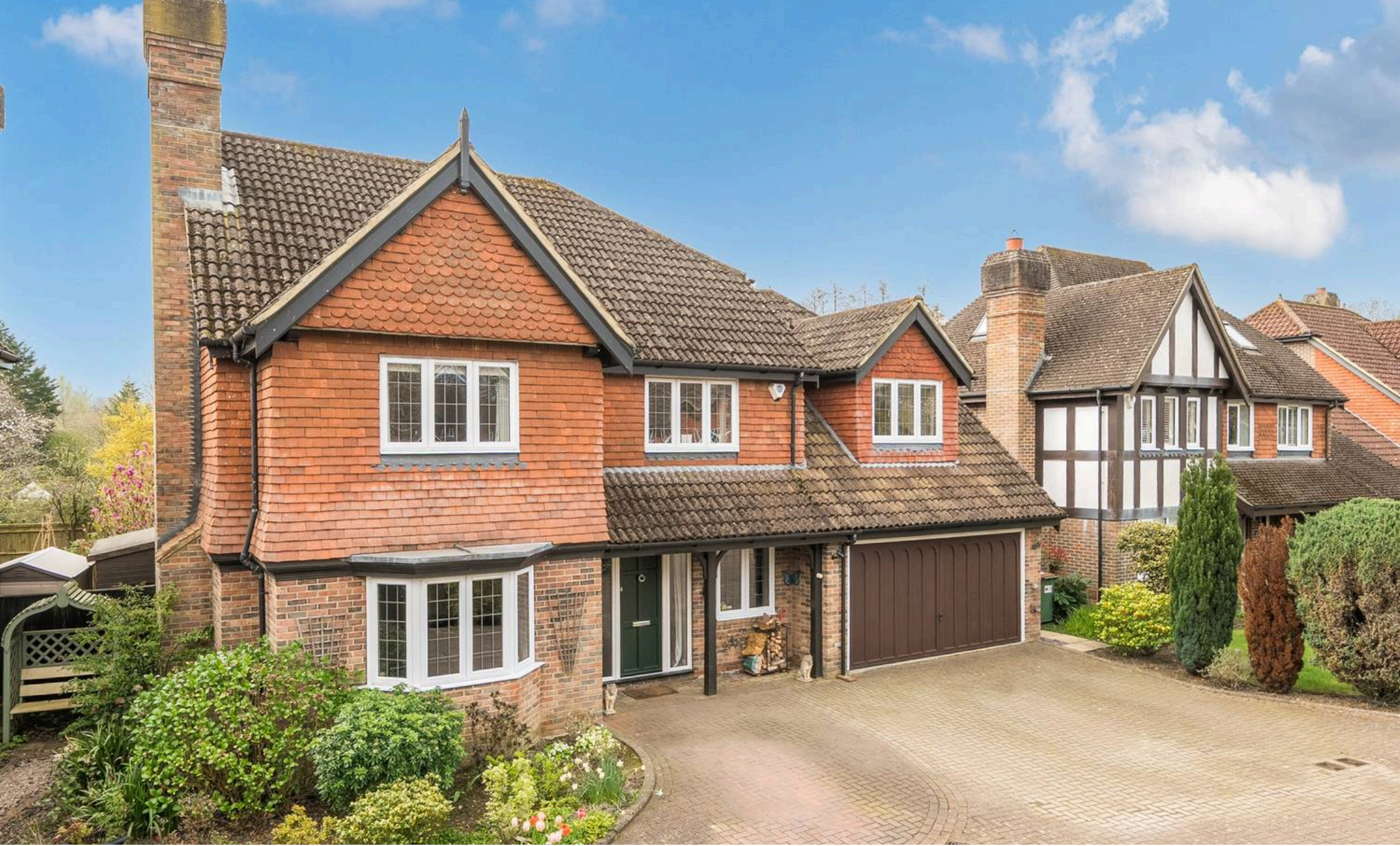
5 Church Close, Ashington - RH20 3DL £850,000