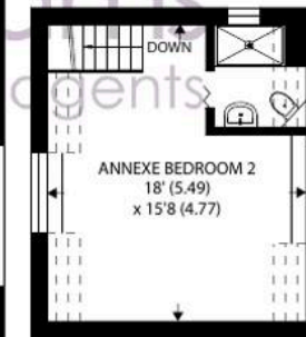
ANNEXE FIRST FLOOR