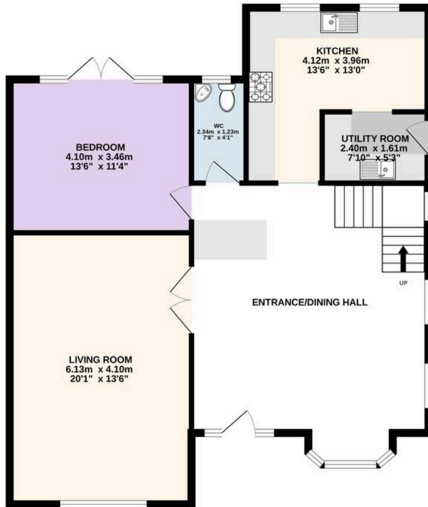
GROUND FLOOR 90.0 sq.m. (969 sq.ft.) approx.