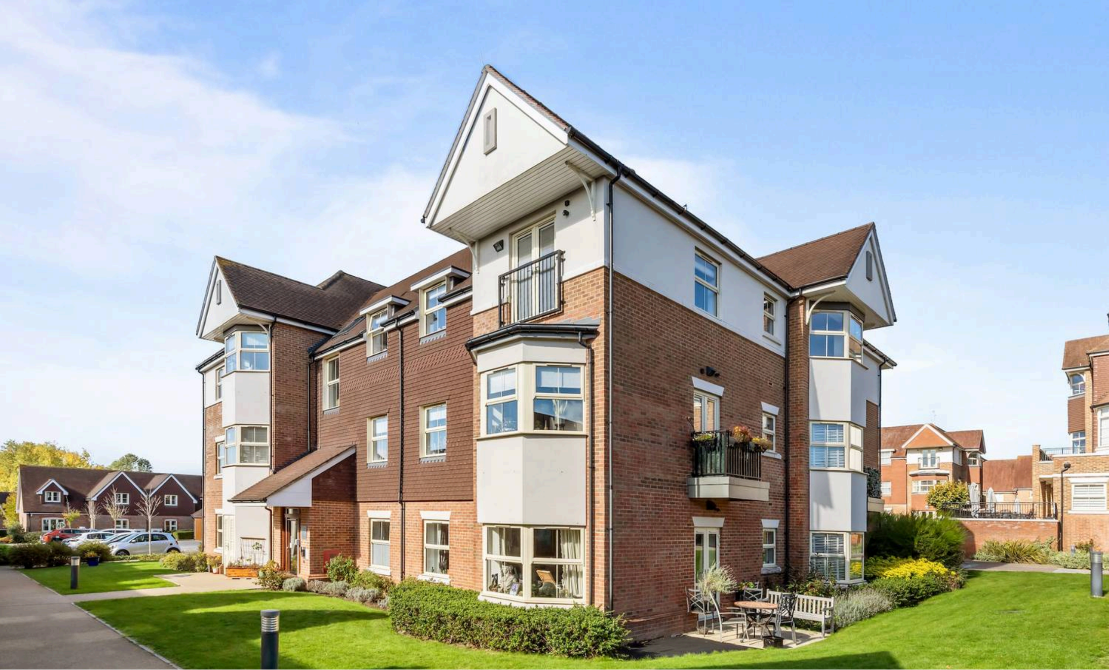
5 Colgate House, Durrants Drive, Faygate, RH12 4AA