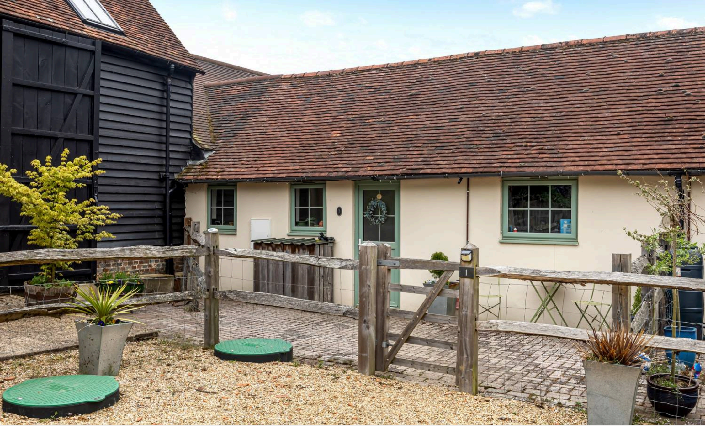
1 Groom Cottage, Rose Hill, Isfield TN22 5UH

£2,000 pcm MANSELL McTAGGART — Trusted since 1947 —