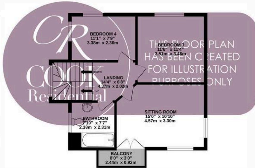
2ND FLOOR 523 sq.ft. (48.6 sq.m.) approx.