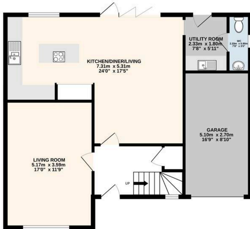
GROUND FLOOR 79.0 sq.m. (851 sq.ft.) approx.