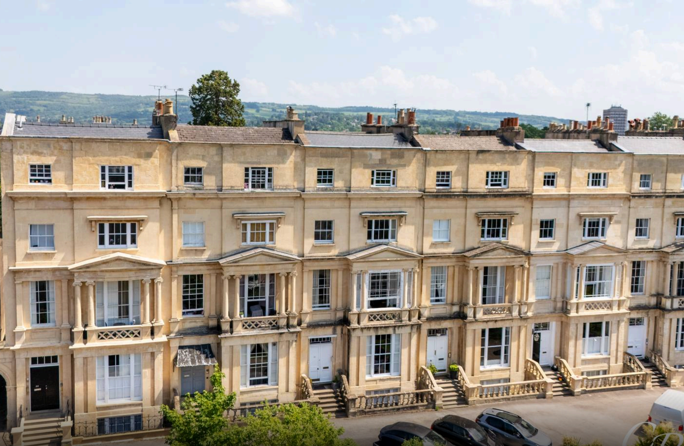
Lansdown Terrace, Cheltenham, GL50 2JP