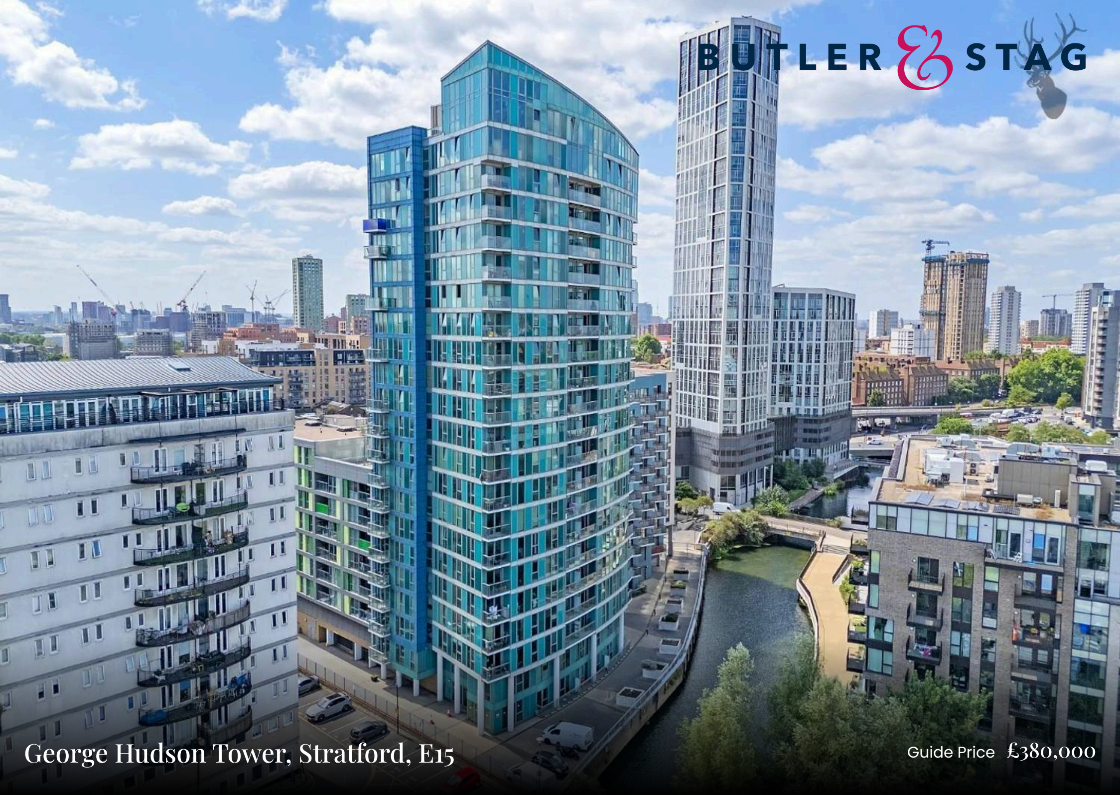
George Hudson Tower, Stratford, E15