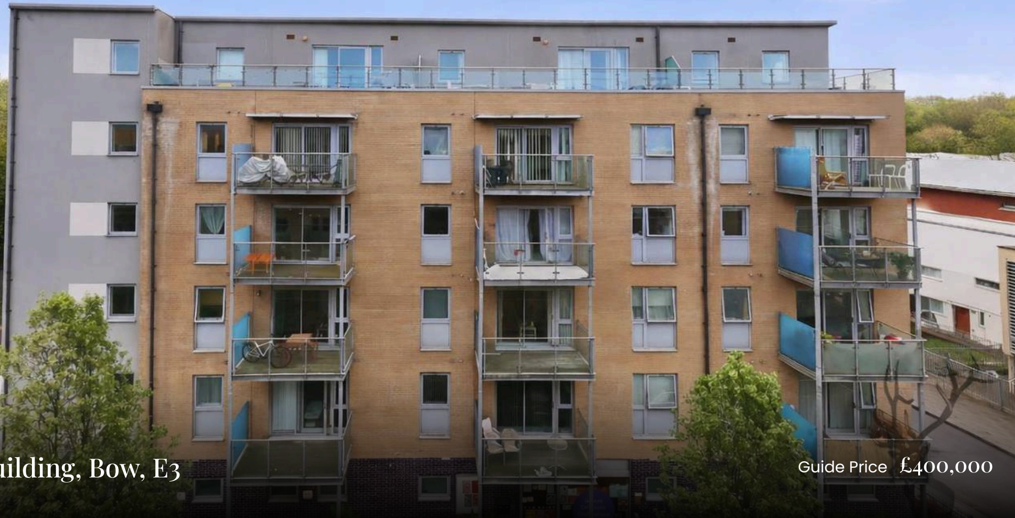
Maha Building, Bow, E3 London