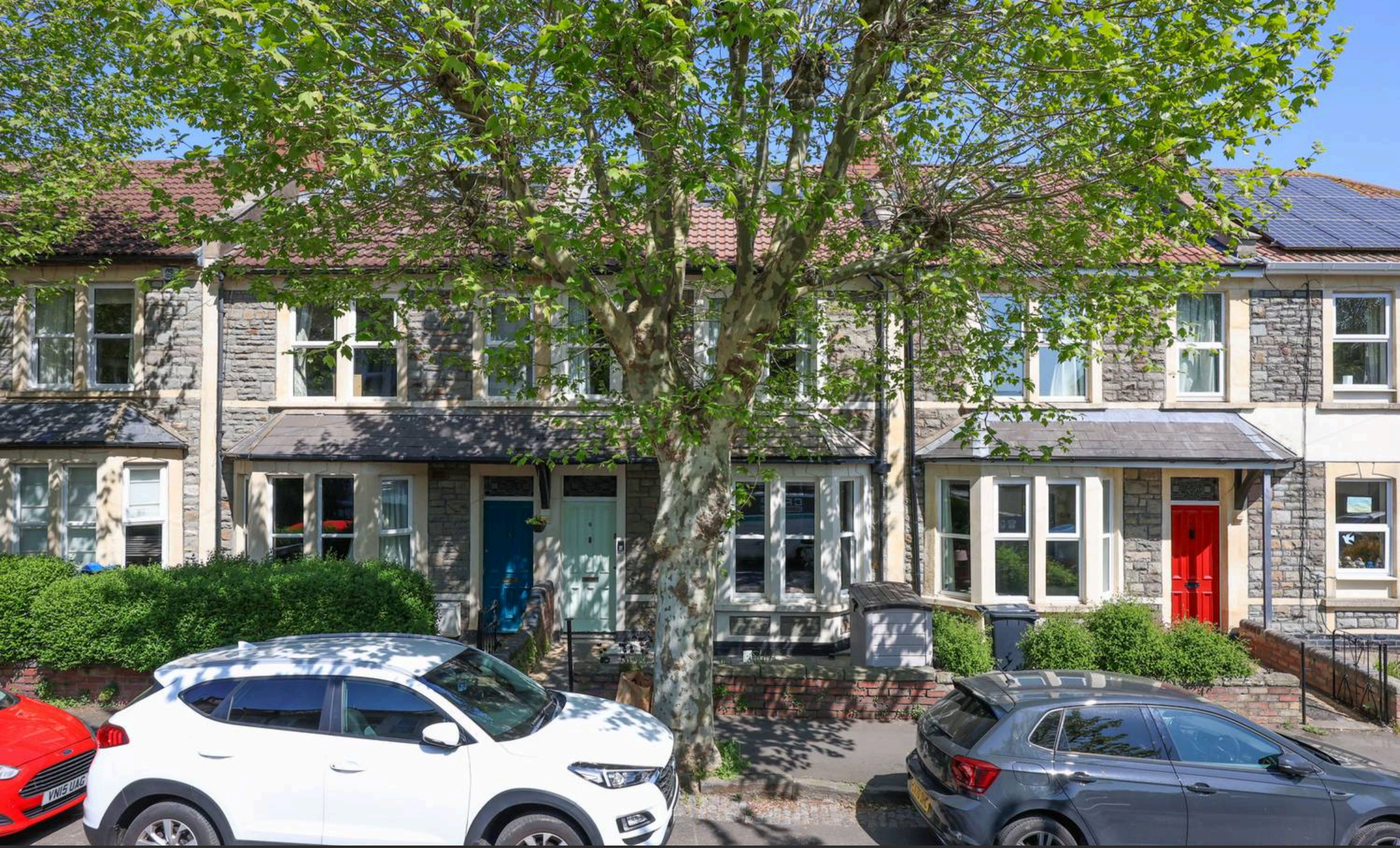
6 Cornwall Road, Bristol £800,000