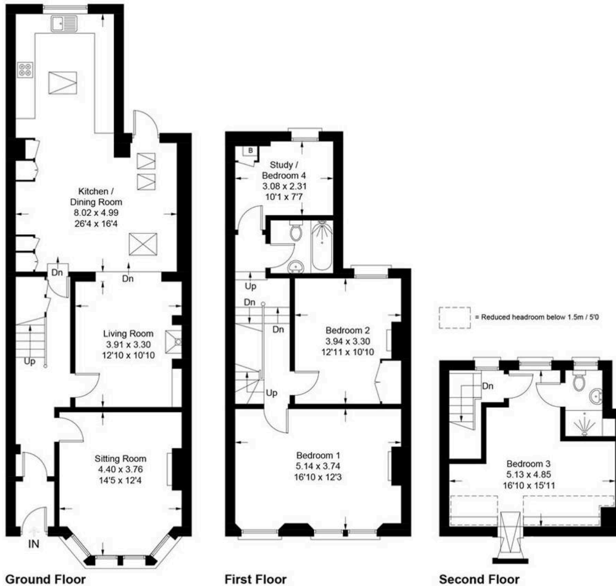
Illustration for identification purposes only, measurements are approximate, not to scale. floorplansUsketch.com © (ID1013184)