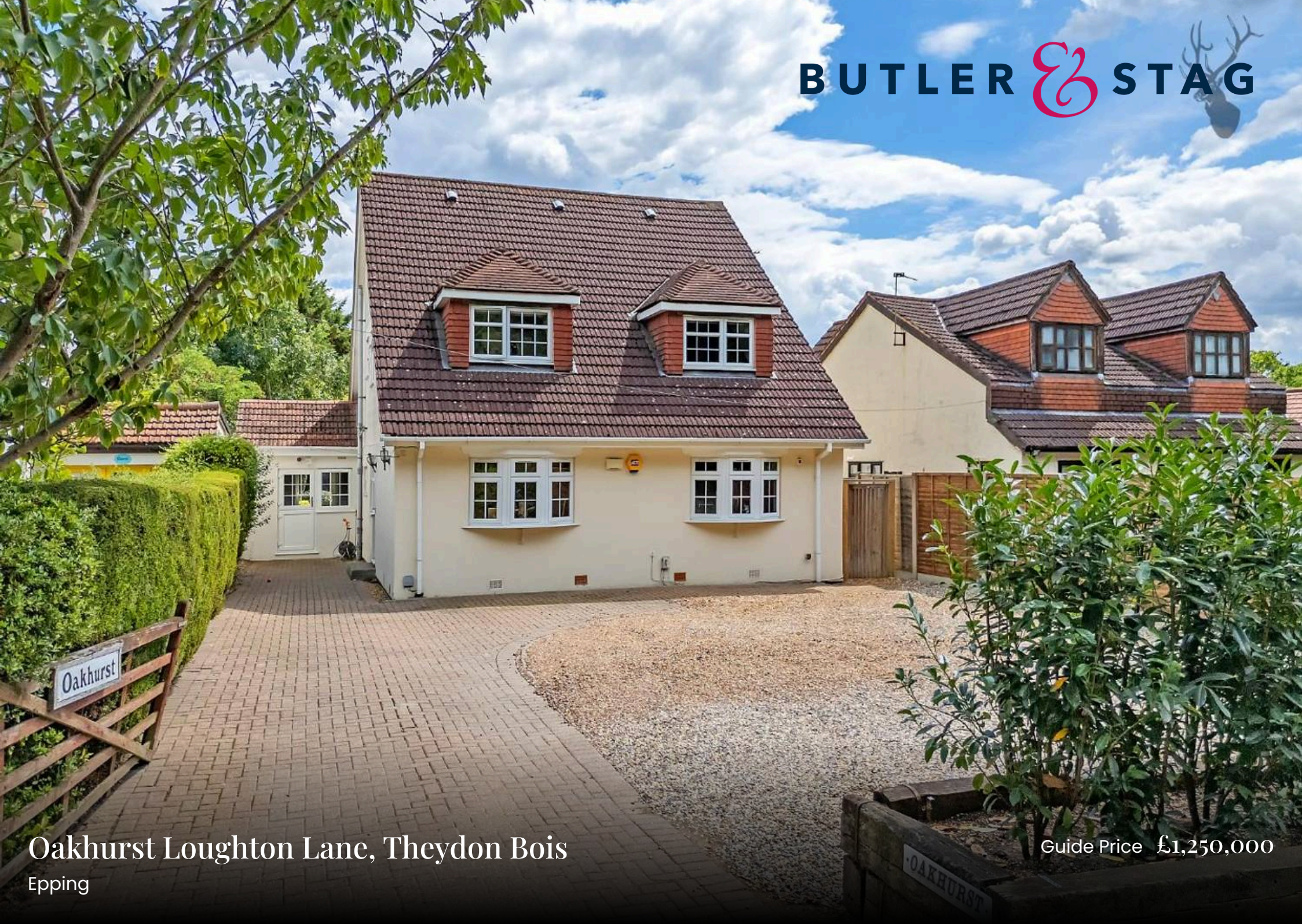
Oakhurst Loughton Lane, Theydon Bois Epping