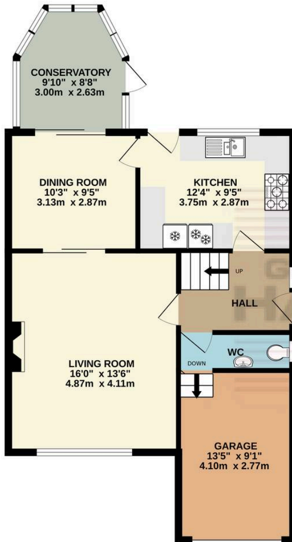
GROUND FLOOR 708 sq.ft. (65.8 sq.m.) approx.