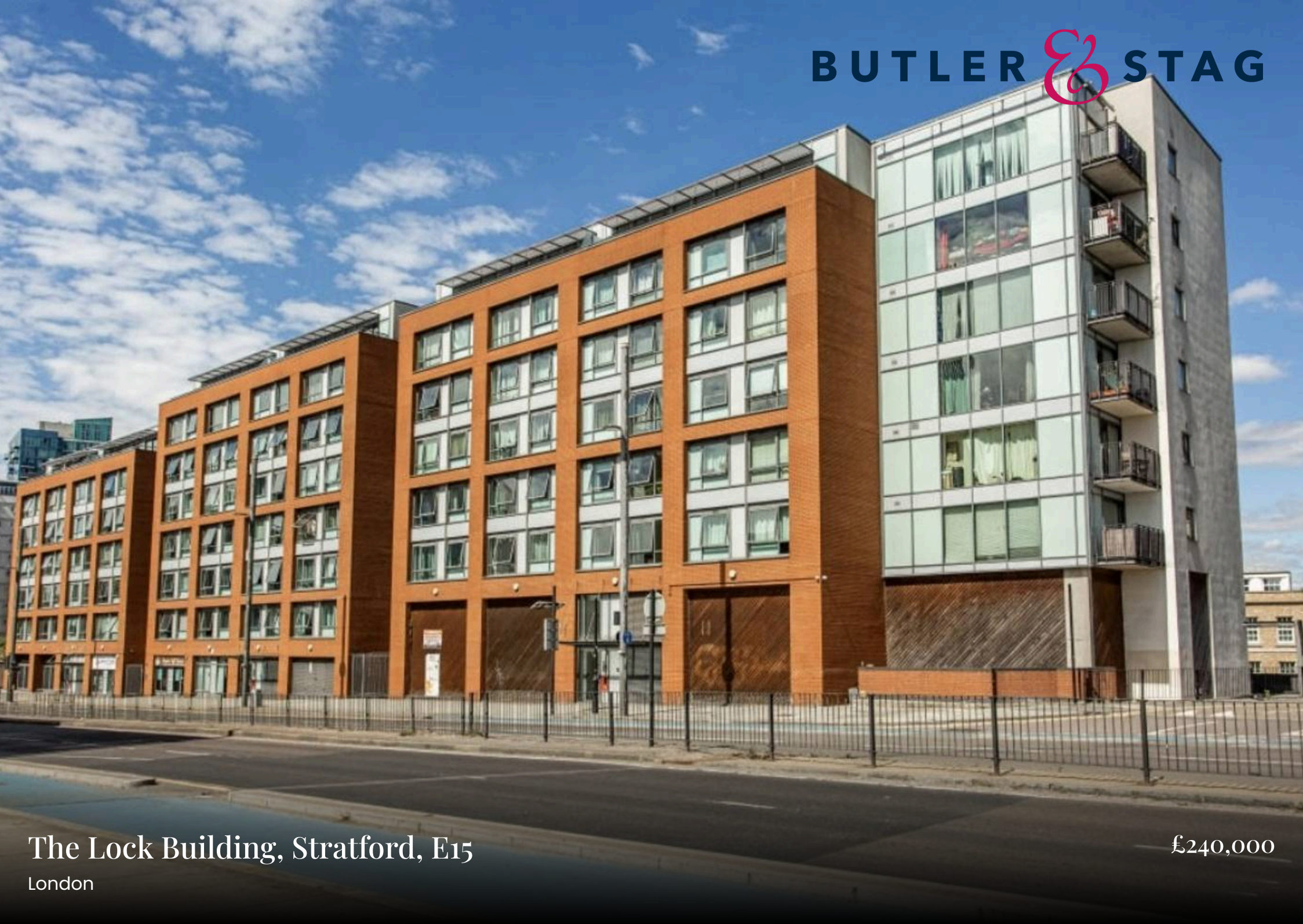
The Lock Building, Stratford, E15 London