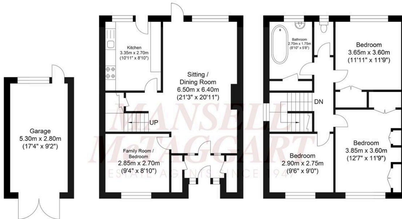
Garage Approximate Floor Area 159.73 sq ft (14.84 sq m)