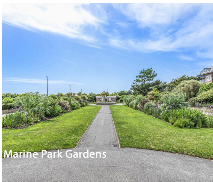
Marine Park Gardens