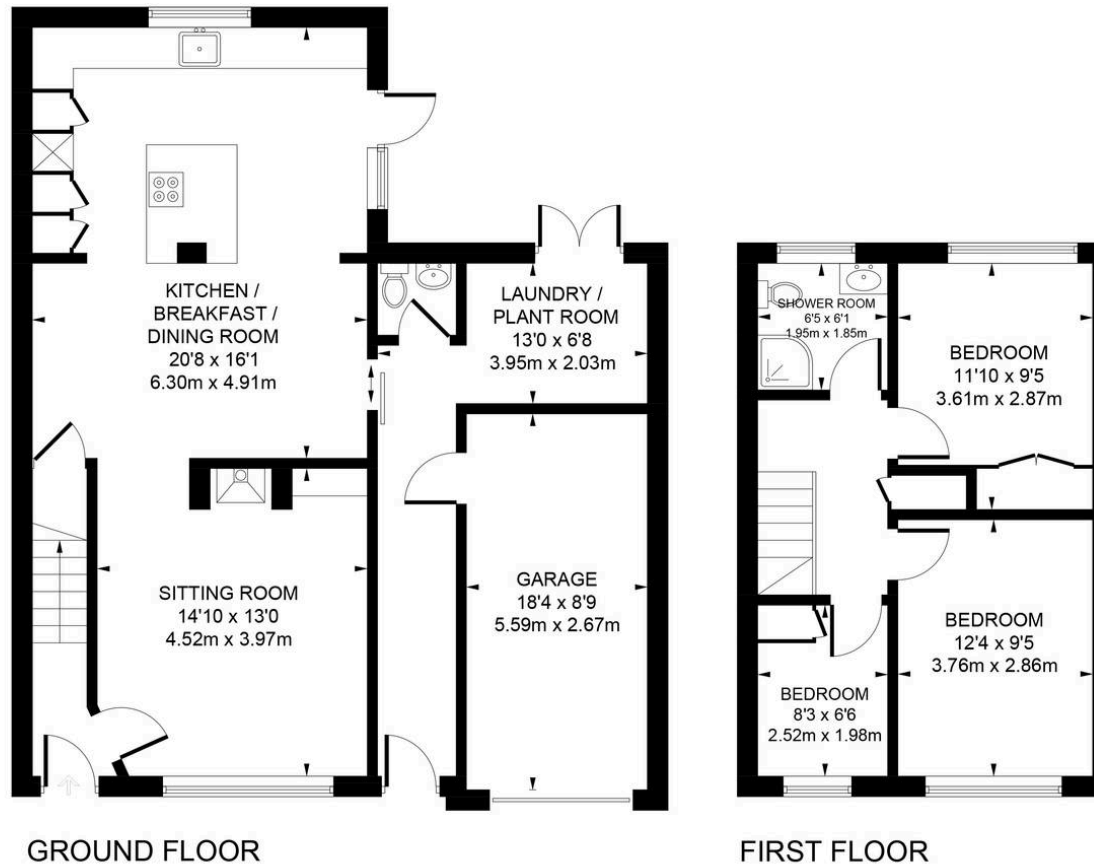
Illustration for identification purposes only, measurements are approximate, not to scale. www.enviromap ltd.co.uk (ID1317218)